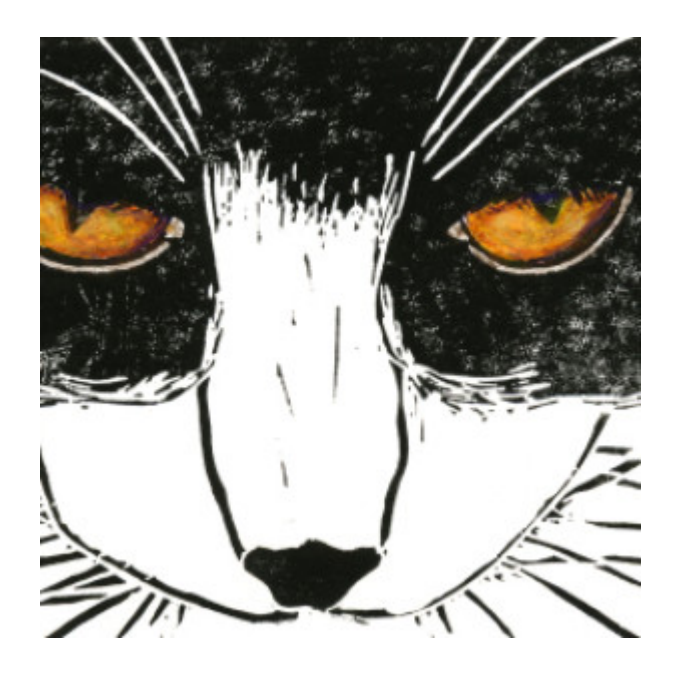
See All AccessArt Printmaking Resources