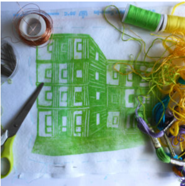
Screen Printing in the Classroom