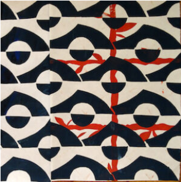
Collograph Printing On Fabric