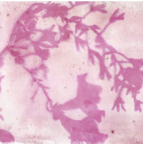
Screen Printing Overlaid Pattern