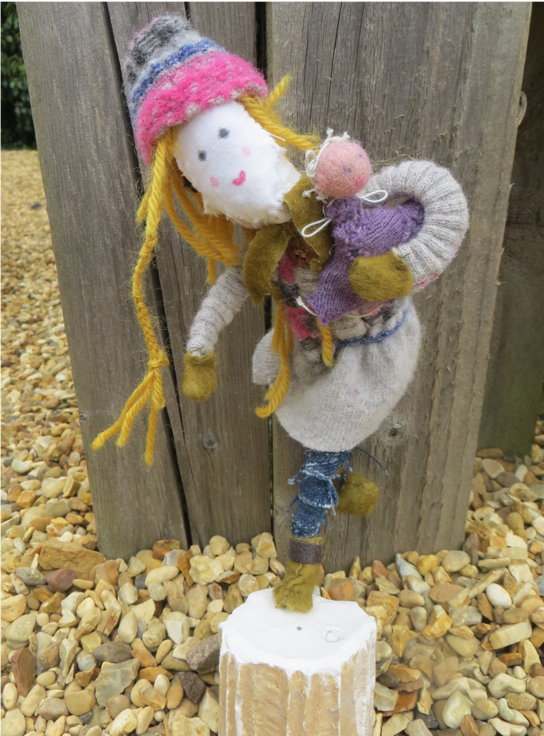
Elsbeth hugging "Lavvy"