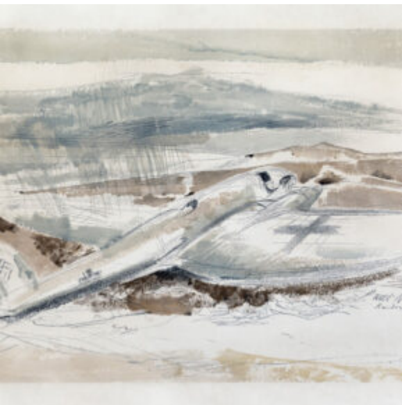
The Raider on the Moors (1940) by Paul Nash.