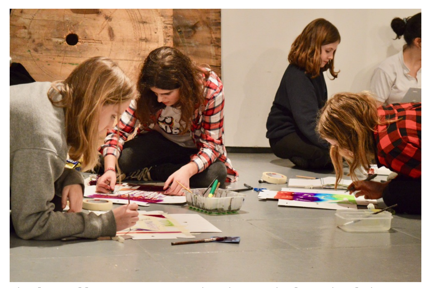
Schools, Colleges, Arts Organisations: Single and Multi-Users From £42

AccessArt is a UK Charity and we believe everyone has the right to be creative. AccessArt provides inspiration to help us all reach our creative potential.