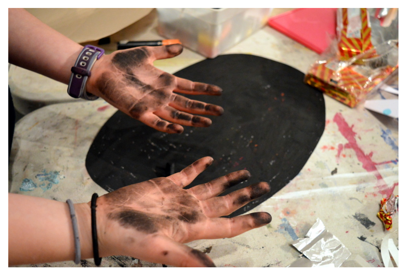
Creative practitioners, educators, teachers, parents, learners...