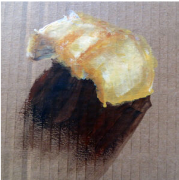
Graphic Inky Still Life!