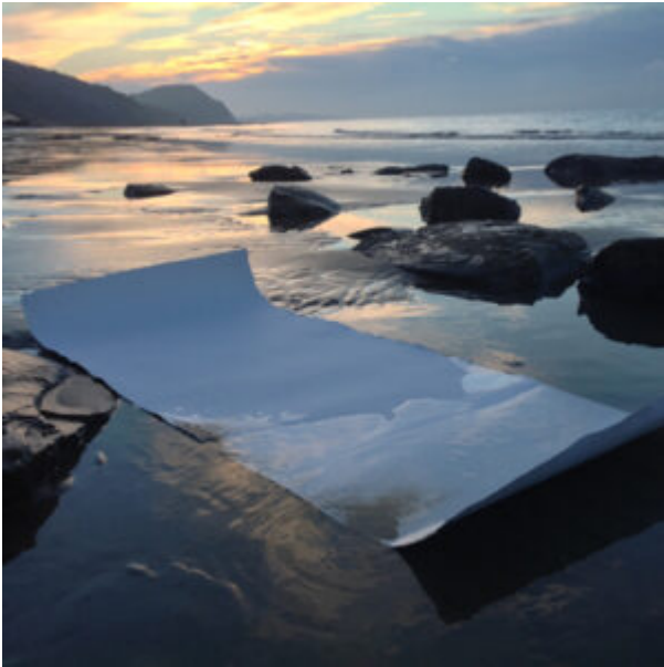
Layers in the Landscape by Emma Davies