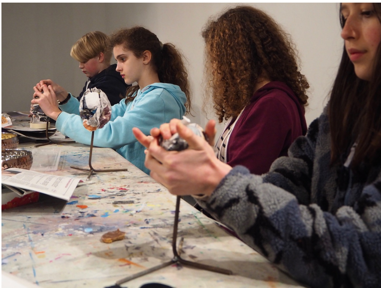
Adding newspaper to the steel armature

begin to add features to. Working this way also give you an option of leaving the clay on the armatures, as we did. As the clay dries, it shrinks, and would crack if the clay were built directly onto a rigid armature. A final advantage of working this way is that if you wish to fire the work, it is easy to cut the form in half, pull out the newspaper and hollow the clay before pressing it back together.