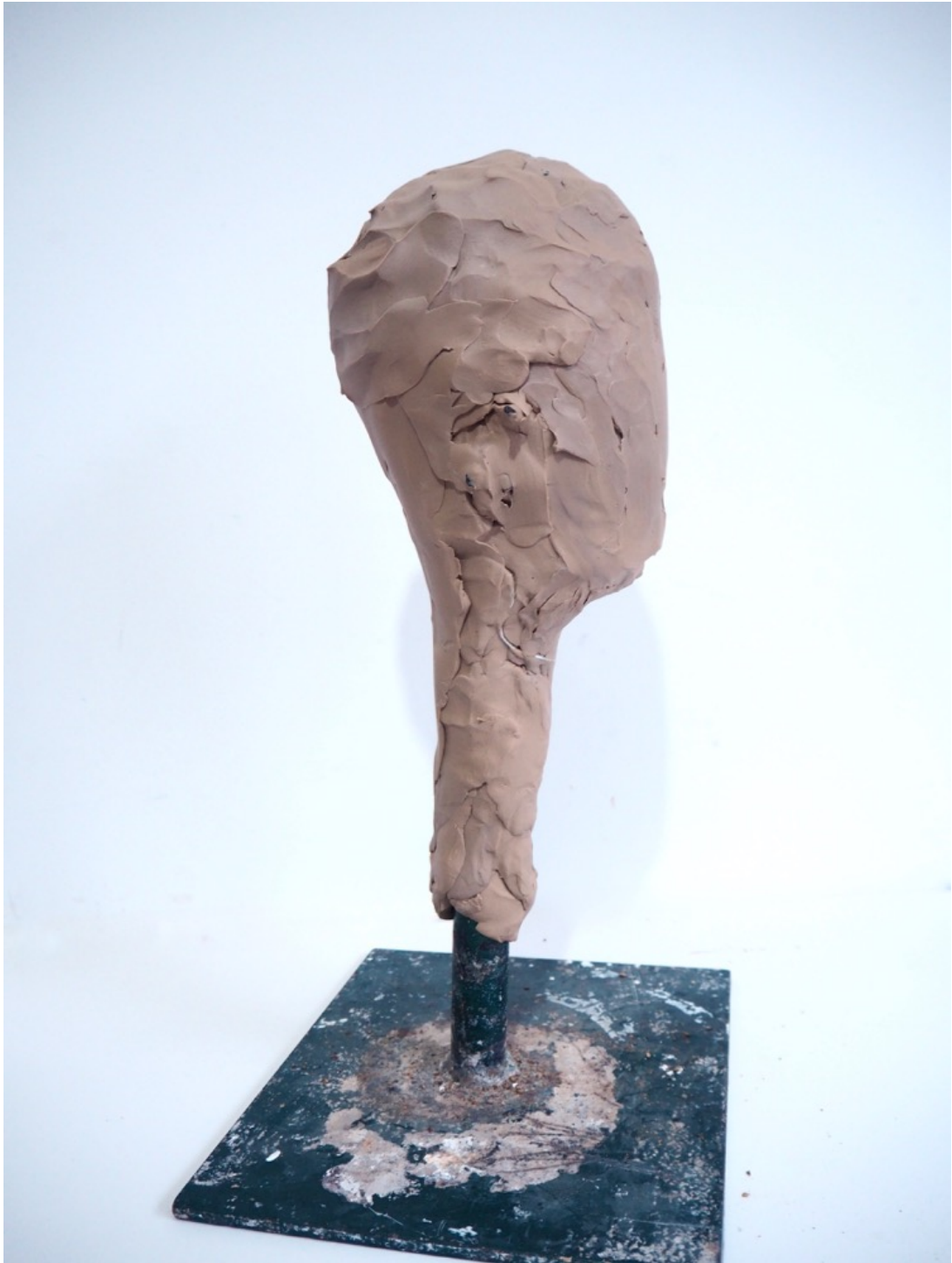
The newspaper is covered with clay