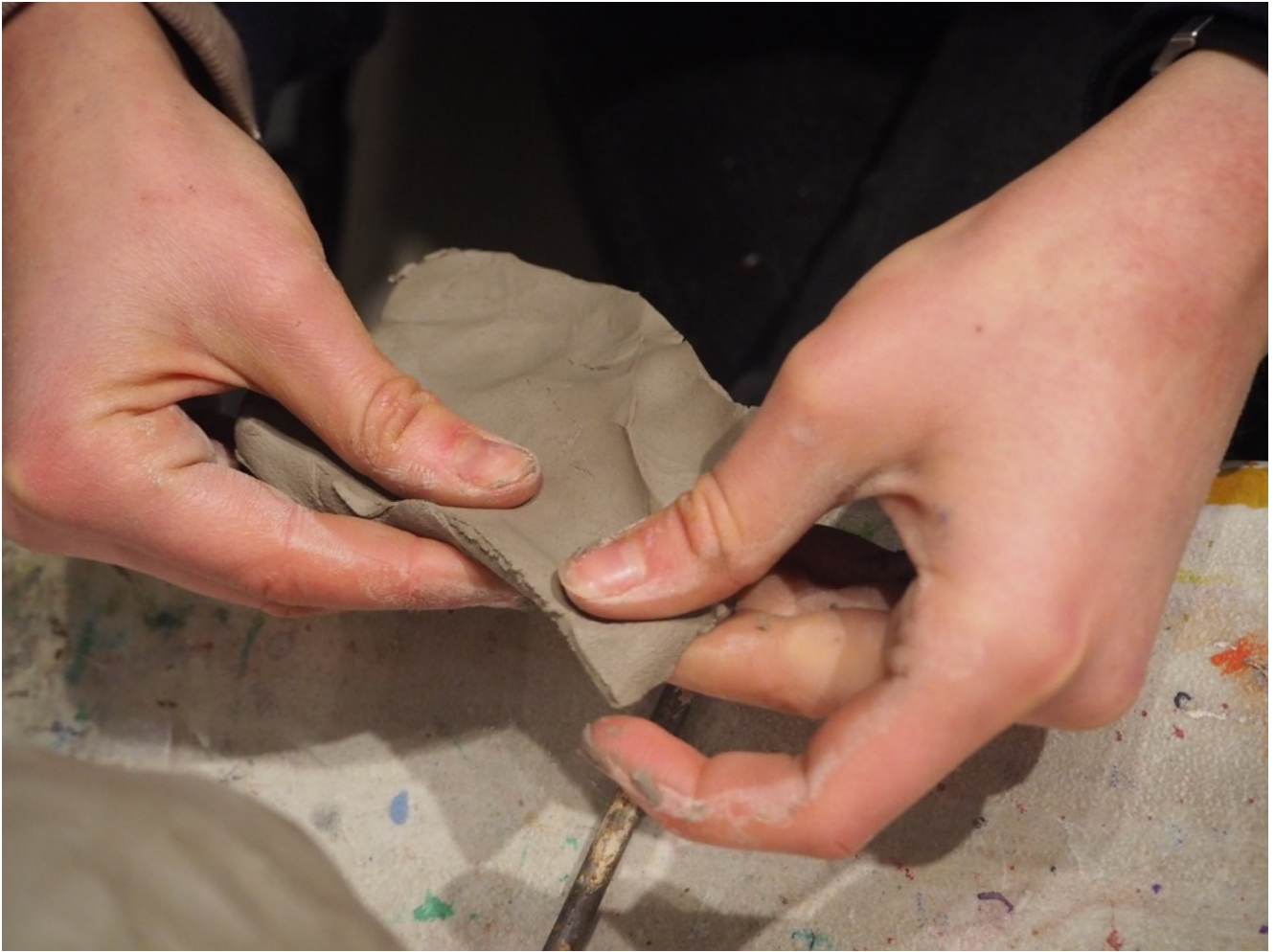
Flattening the clay before adding to the armature