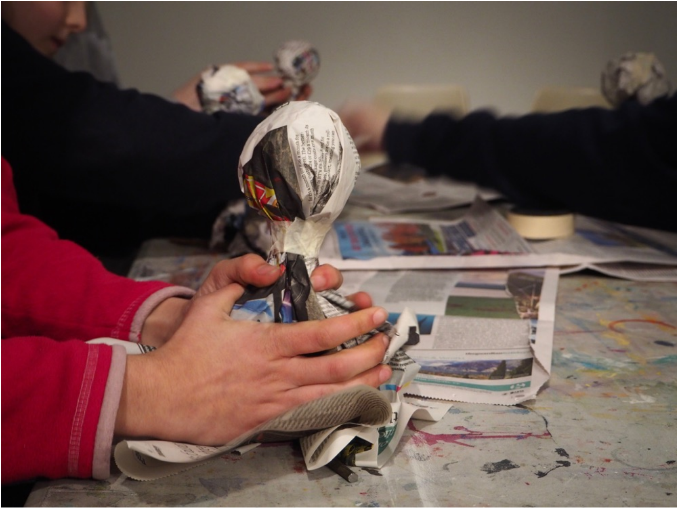
Covering the 'brains' with paper and scrunching paper down the neck