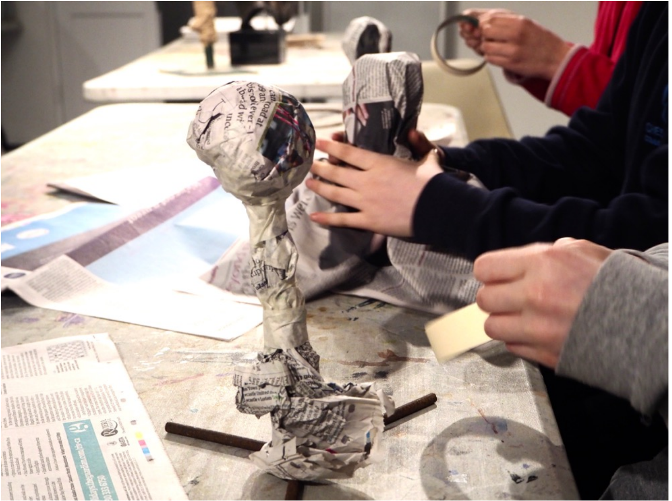
Securing at the neck with tape