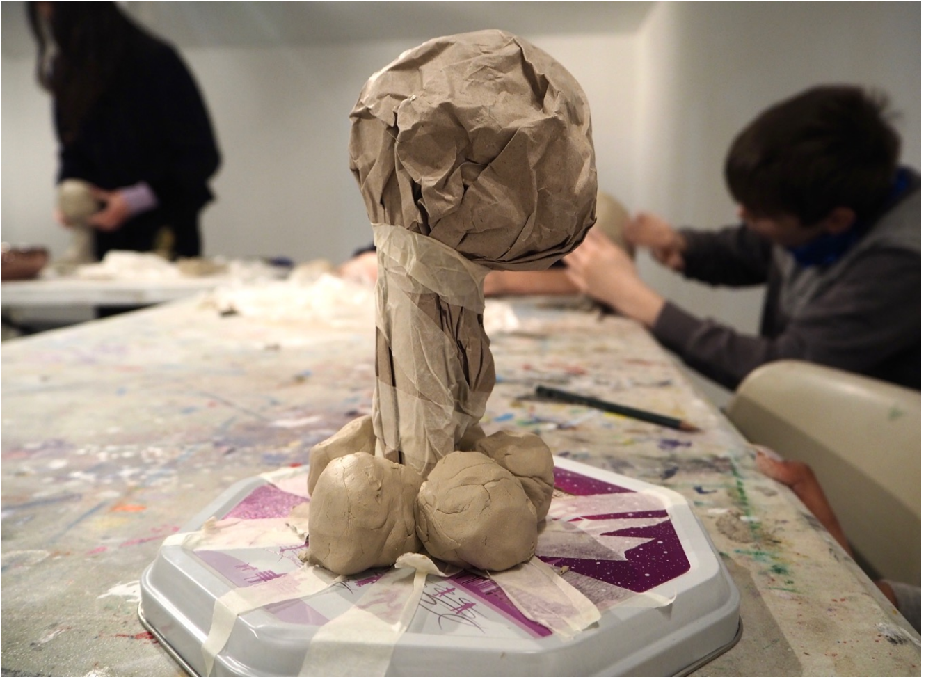
Adding clay to stabilise the base of the form