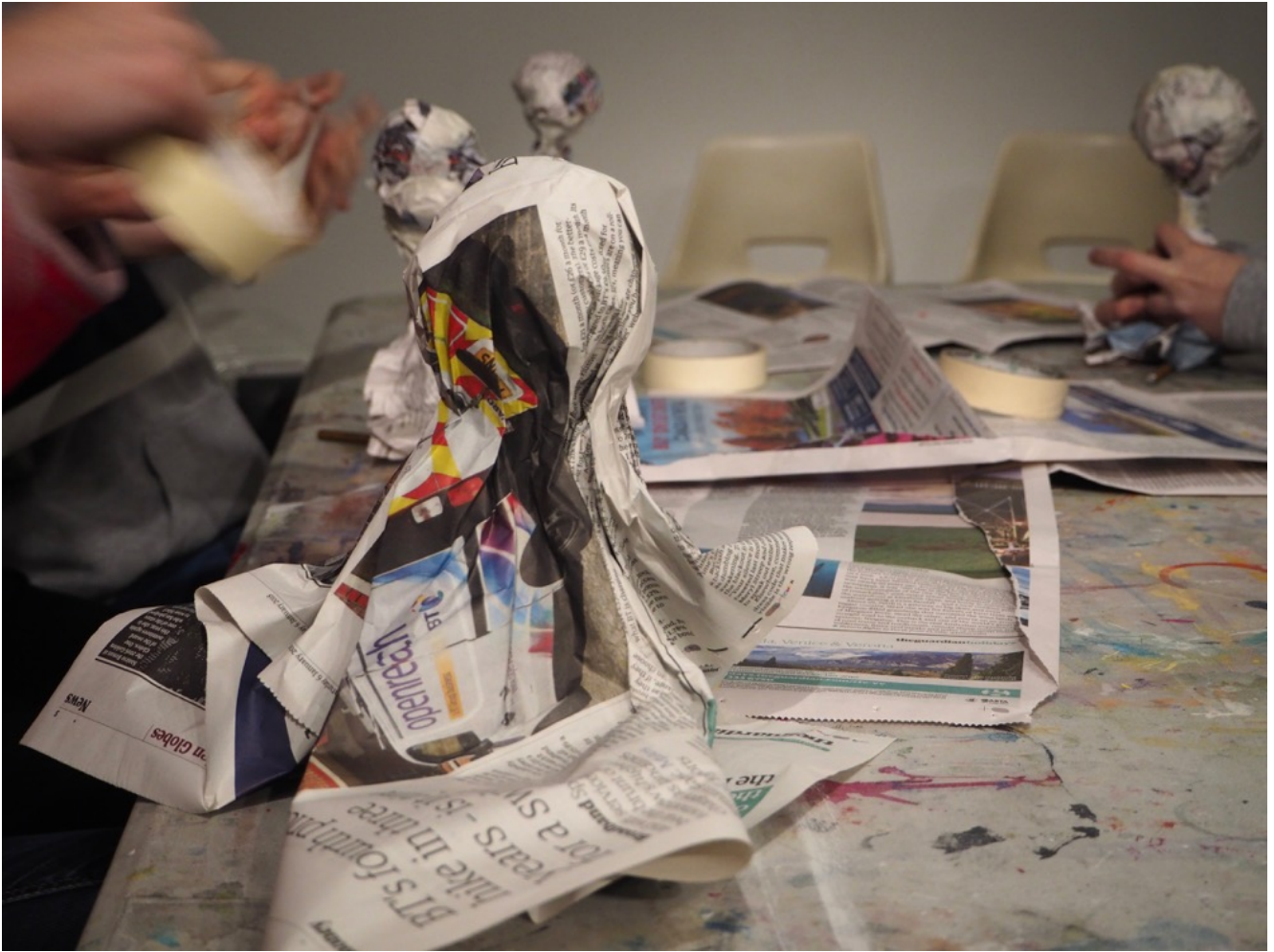
Bulking out the form using scrunched newspaper