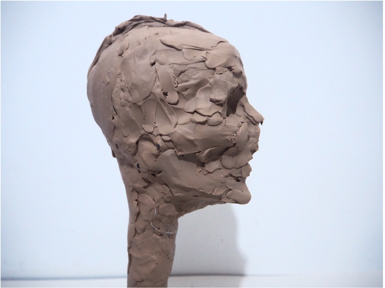
Building up the outlines in clay