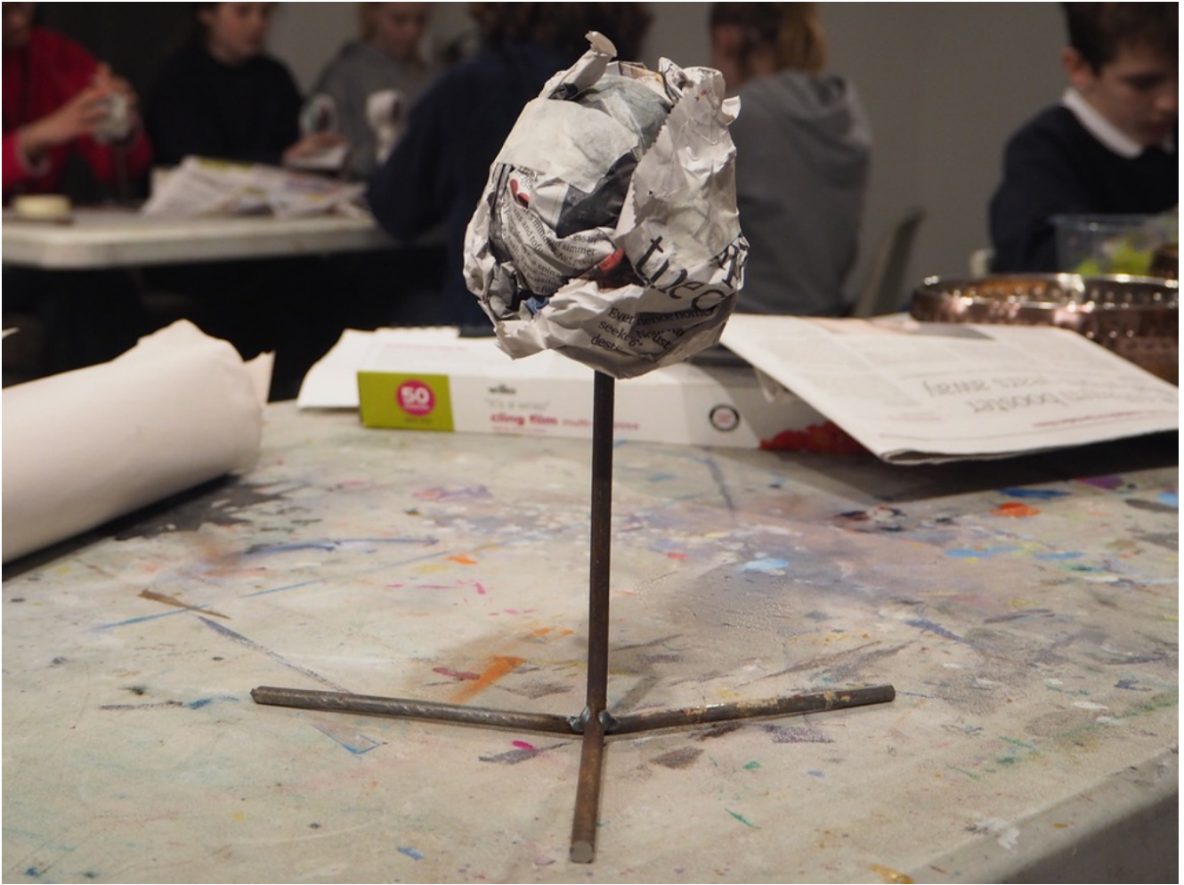
Steel armature for clay head, with 'brains' of scrunched newspaper