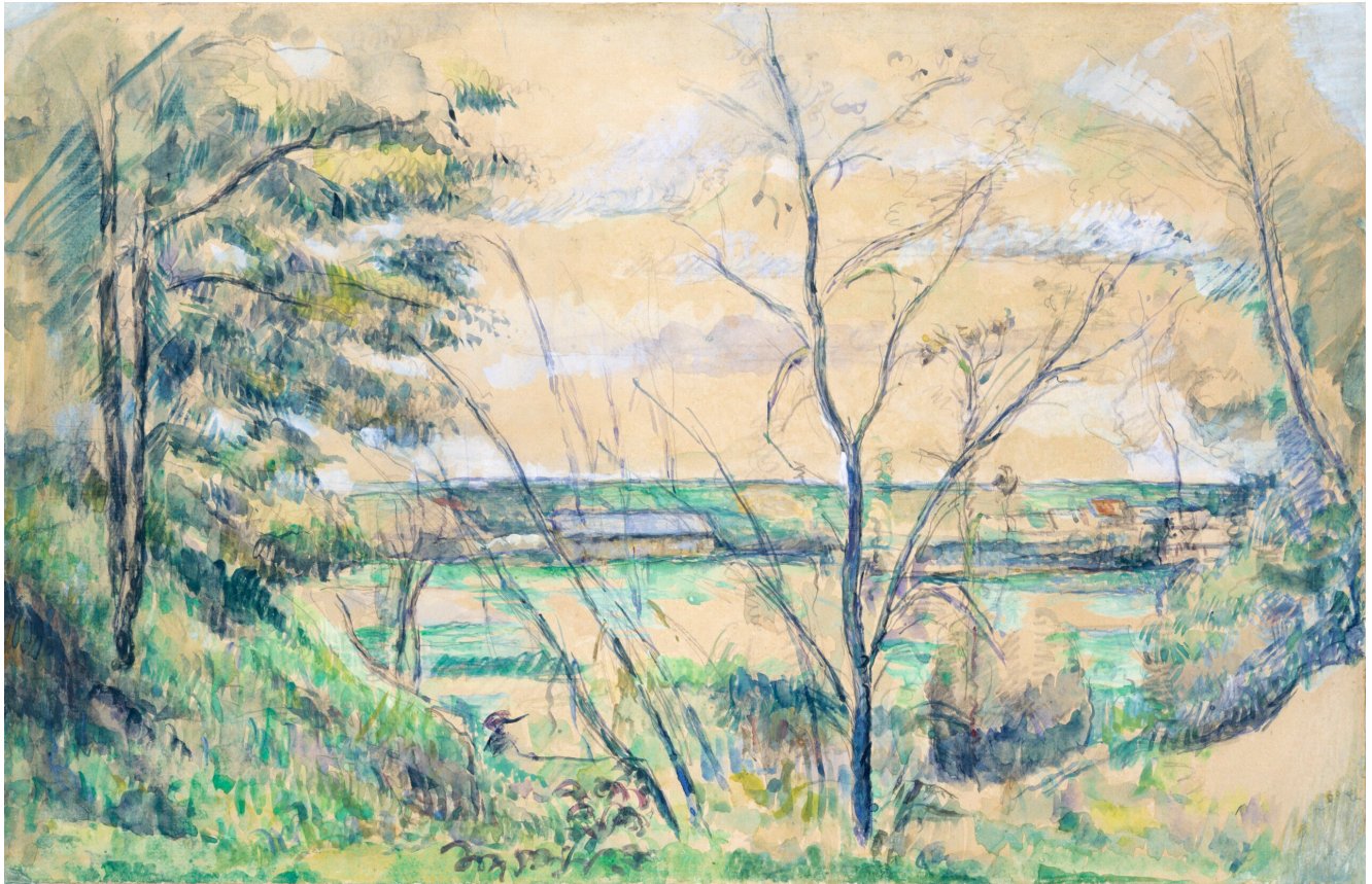
In the Oise Valley (ca. 1878–1880) by Paul Cézanne.

The aim here is to experiment and discover. Choose as many or as few challenges as you wish. Fill your sketchbook!