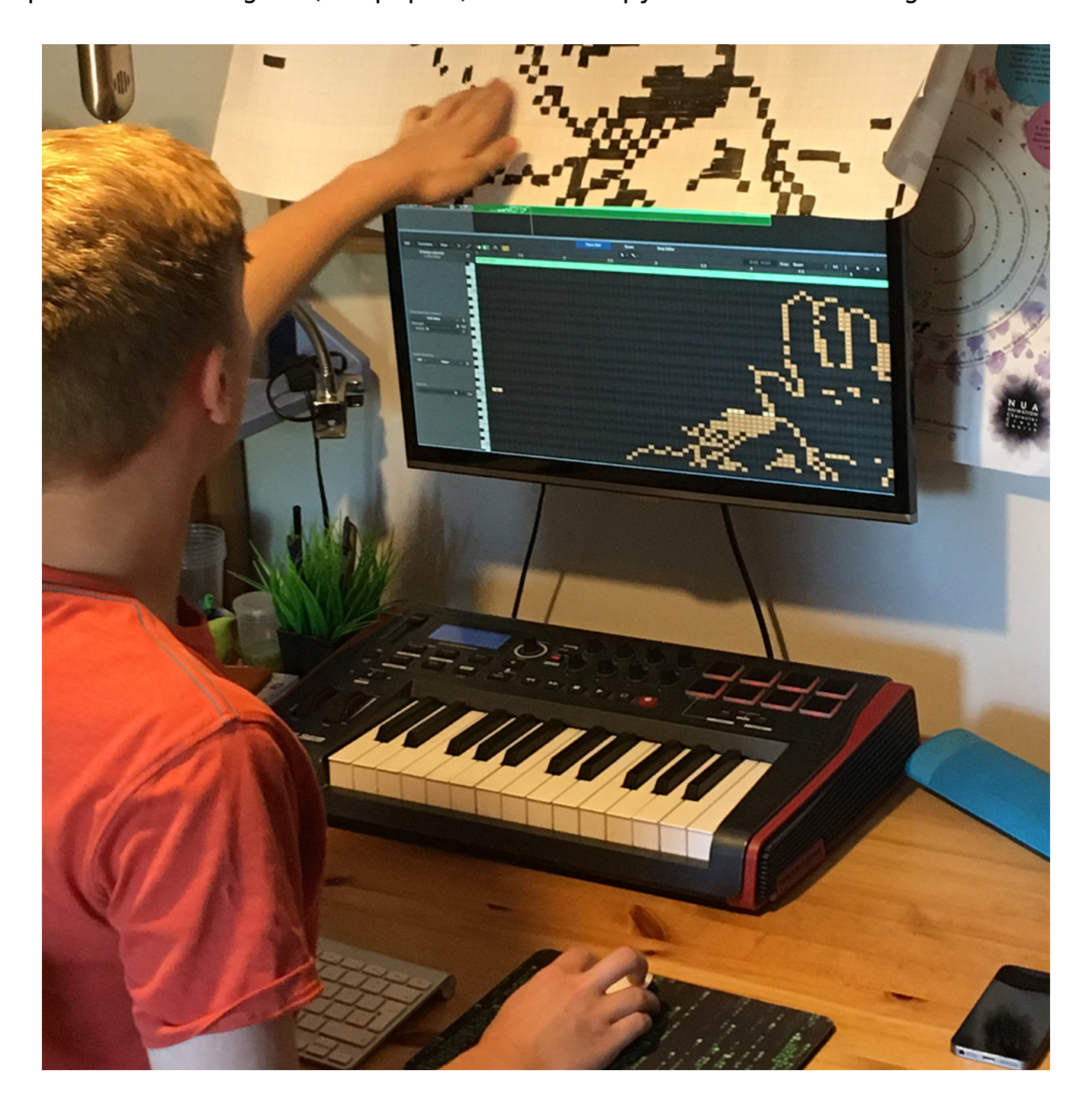
Once I have finished transcribing Rowan's pixelated image, I can choose an overall sound (for example: Piano, Drum kit, Synthesiser) to apply to the pixels.

pixelated images (on paper) and I copy them onto the grid.