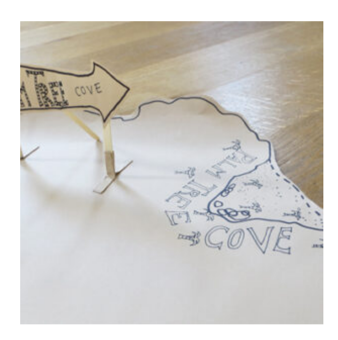
This is featured in the 'Typography and Maps' pathway