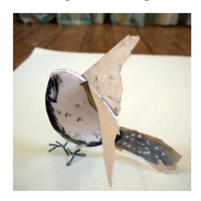
Featured in the 'Making Birds' pathway