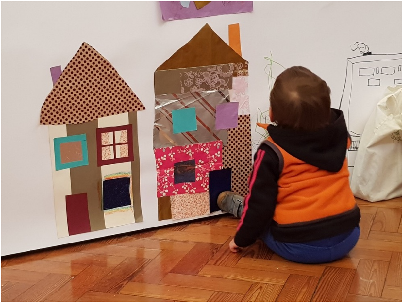
Creating the AccessArt Village Collage in the Ruskin Gallery