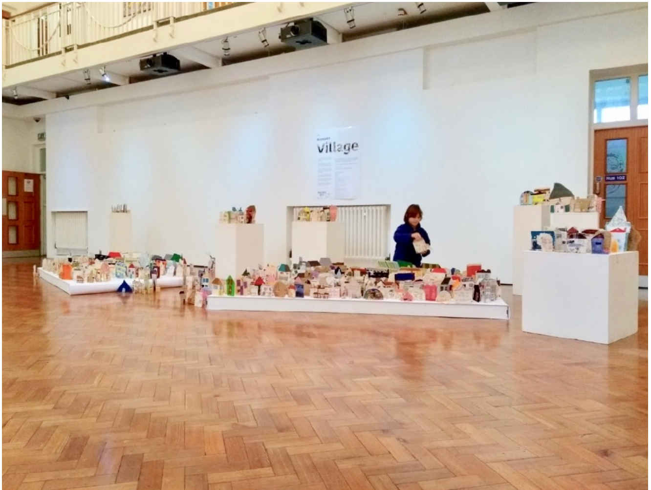
The AccessArt village pop-up exhibition in the Ruskin Gallery, ARU, Cambridge

This was a wonderful afternoon celebrating the AccessArt Village alongside members of the Emmaus, Cambridge as well as participating artists and teachers from as far as London and families from our local, Cambridge community.