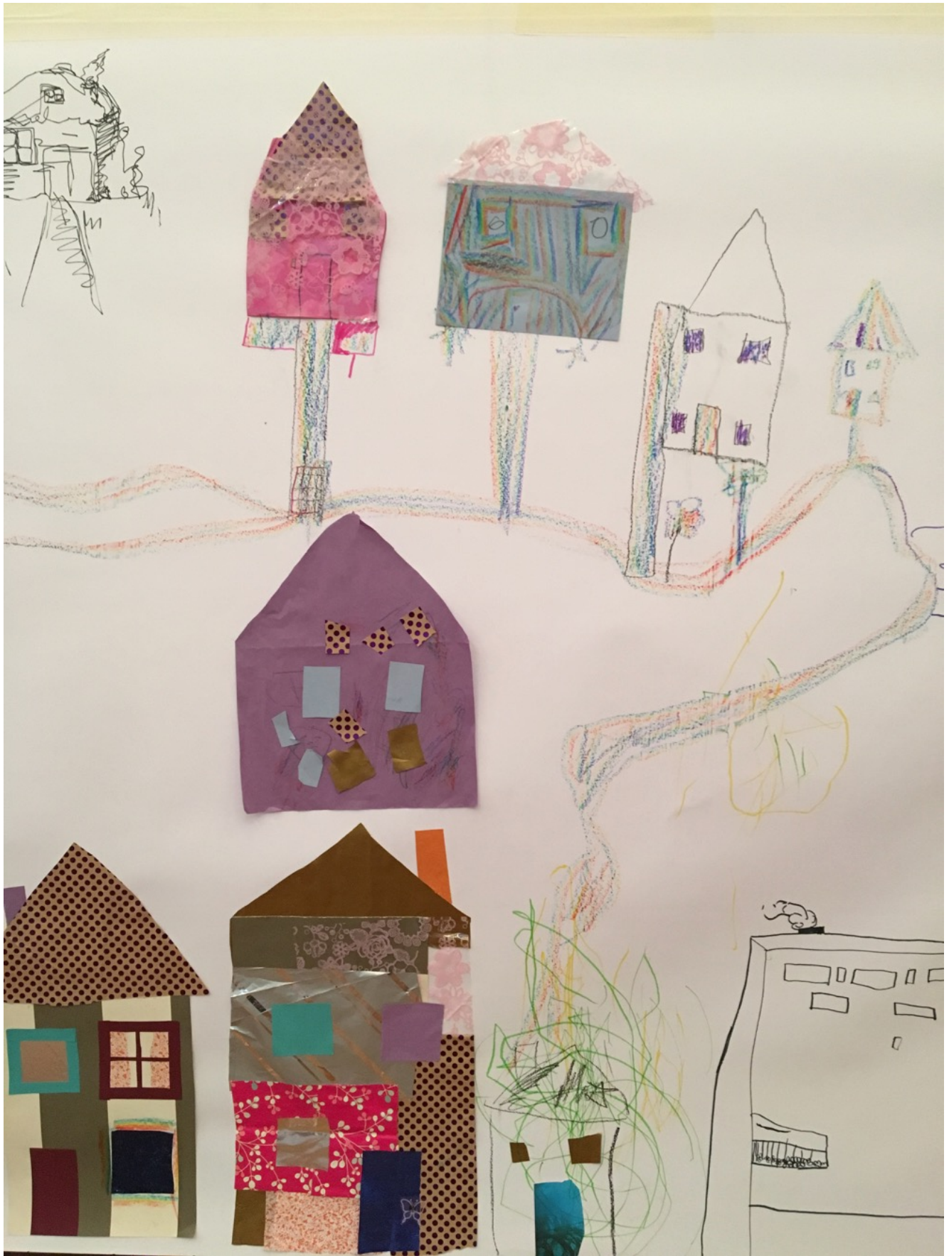
Creating the AccessArt Village Collage in the Ruskin Gallery