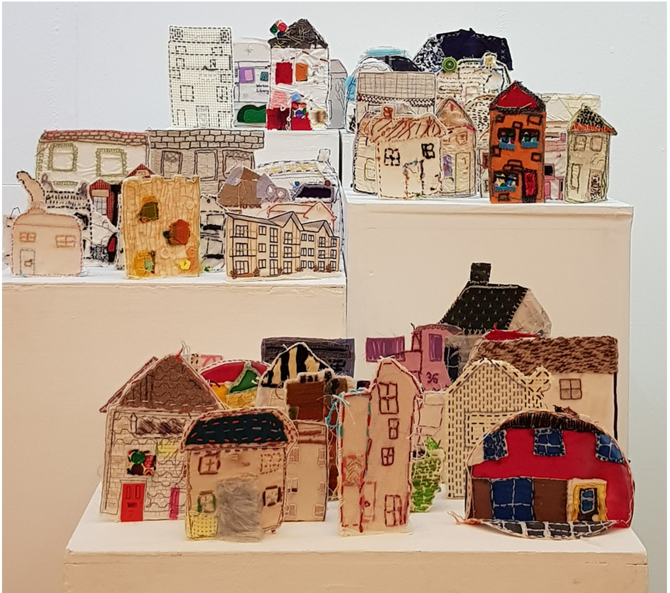
A selection of the hand-sewn village houses on display

There's no place like home so if you have a home smile and be grateful for it. We all must ask ourselves what can I do in the society, community, country that I live. What can I do to at least try to ensure that everyone feels at home?