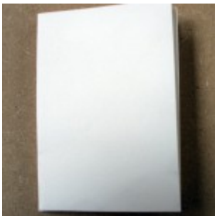
How to make a simple folded sketchbook

AccessArt offers Inset and CPD around Sketchbooks. See our Inset Brochure here , or contact us on 01223 606139, info@accessart.org.uk