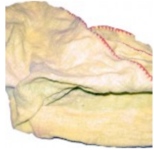
Thinking Creatively about Sketchbooks!

UK Charity AccessArt welcomes artists, educators, teachers and parents both in the UK and overseas.