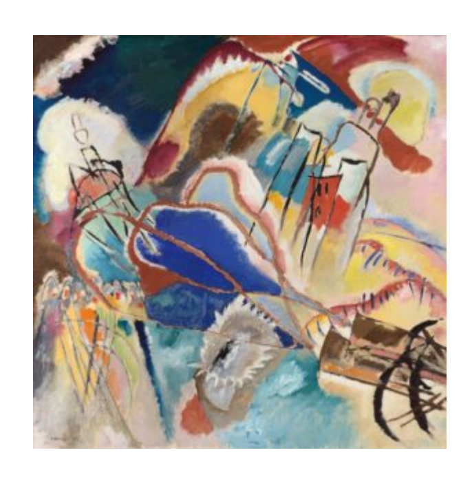
drawing source material: orchestras