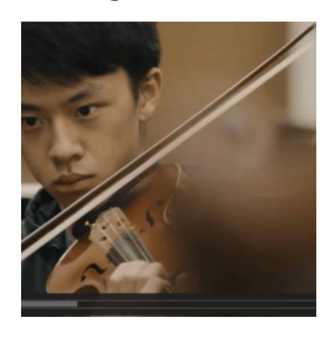
A Cheerful Orchestra