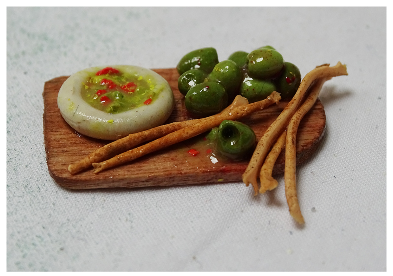
A mini meal of breadsticks, olives and guacamole

Making mini meals from Sculpey or Fimo clay takes good eye sight and nimble fingers! Here are some tips and tricks I have learnt along the way.