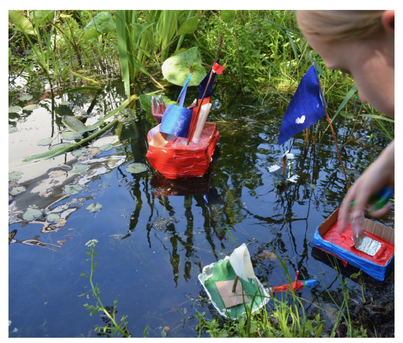
Boats that Float - Workshop with year four pupils at Ridgefield Primary School

This was an afternoon session for year four pupils at <a href="Ridgefield Primary School">Ridgefield Primary School</a>, Cambridge.