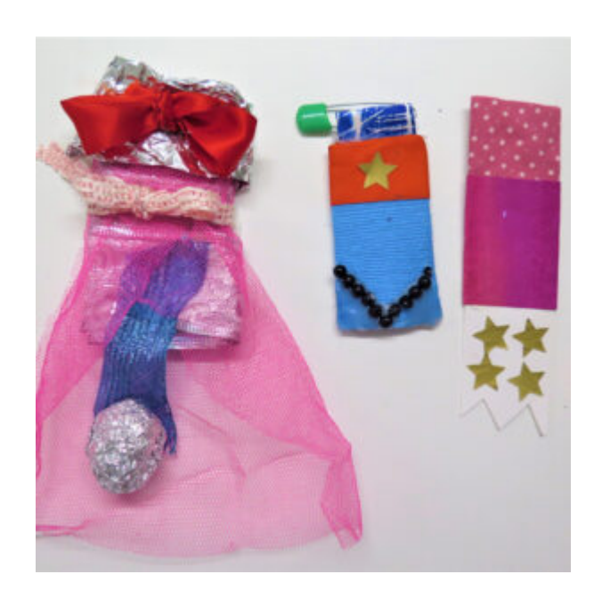
Featured in the 'Playful Making' pathway Talking Points: Introduction to sculpture