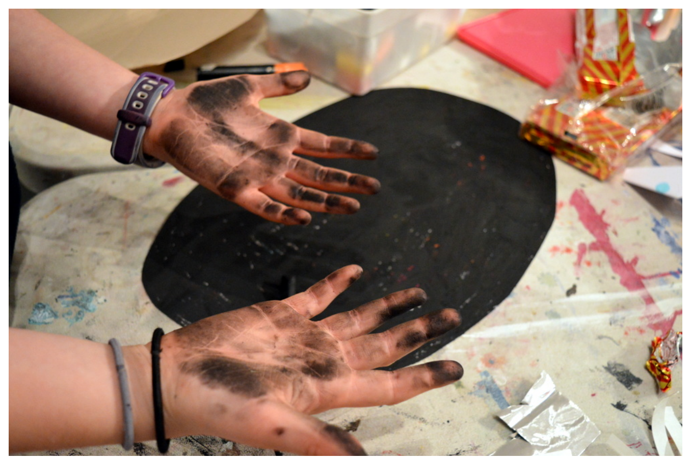
Creative practitioners, educators, teachers, parents,