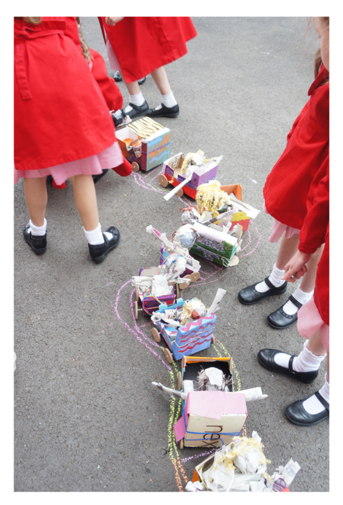
Getting all the carriages lined up

I love working on large scale projects with an element of collaboration and this project certainly allowed for that. What it also did was to allow KS1 children an opportunity to put into practice their personal ideas and imagination to create a model with moving parts which was then brought