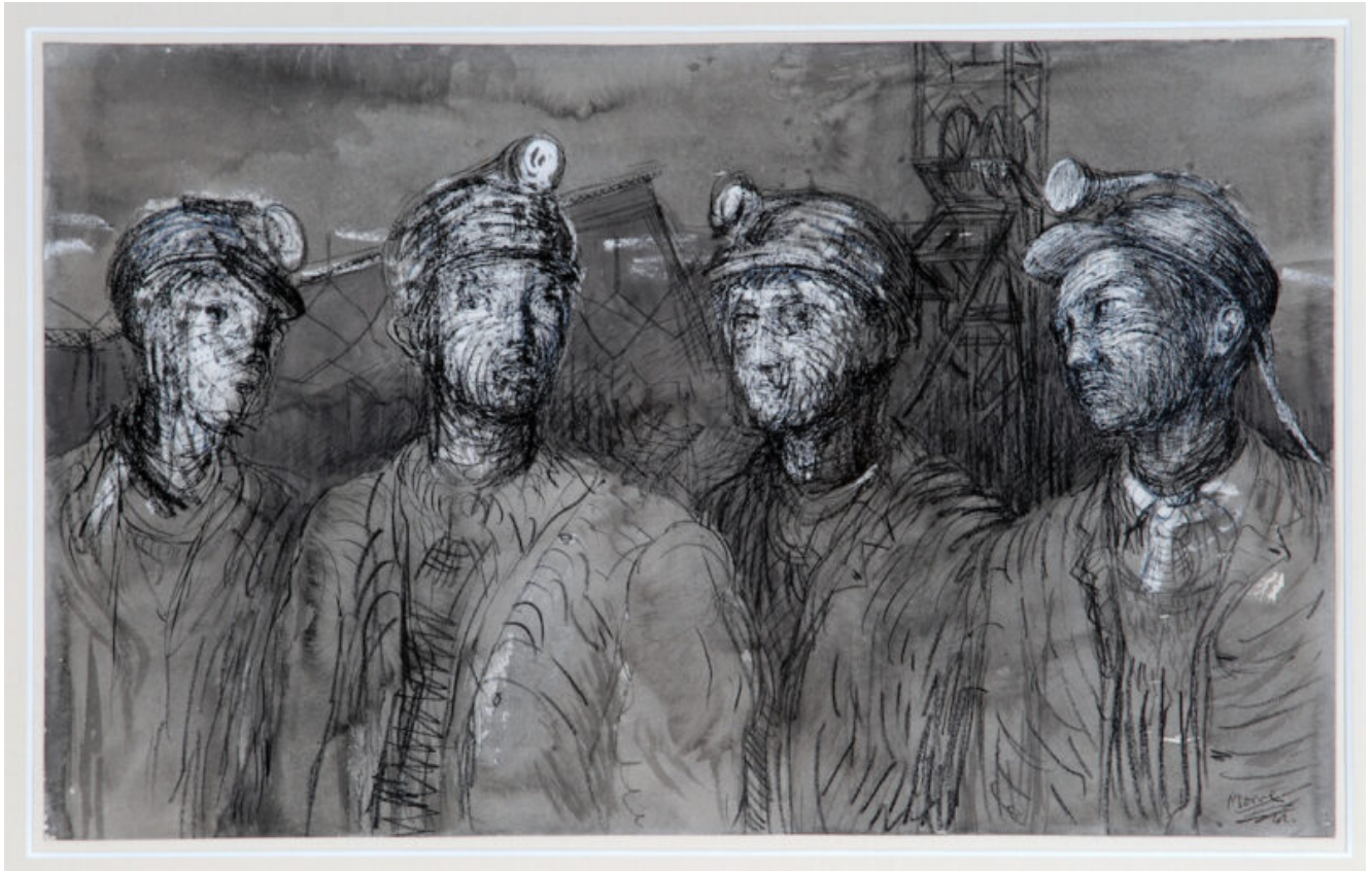
Pit Boys at Pit Head 1942 by Henry Moore, Wakefield Permanent Art Collection LR copy