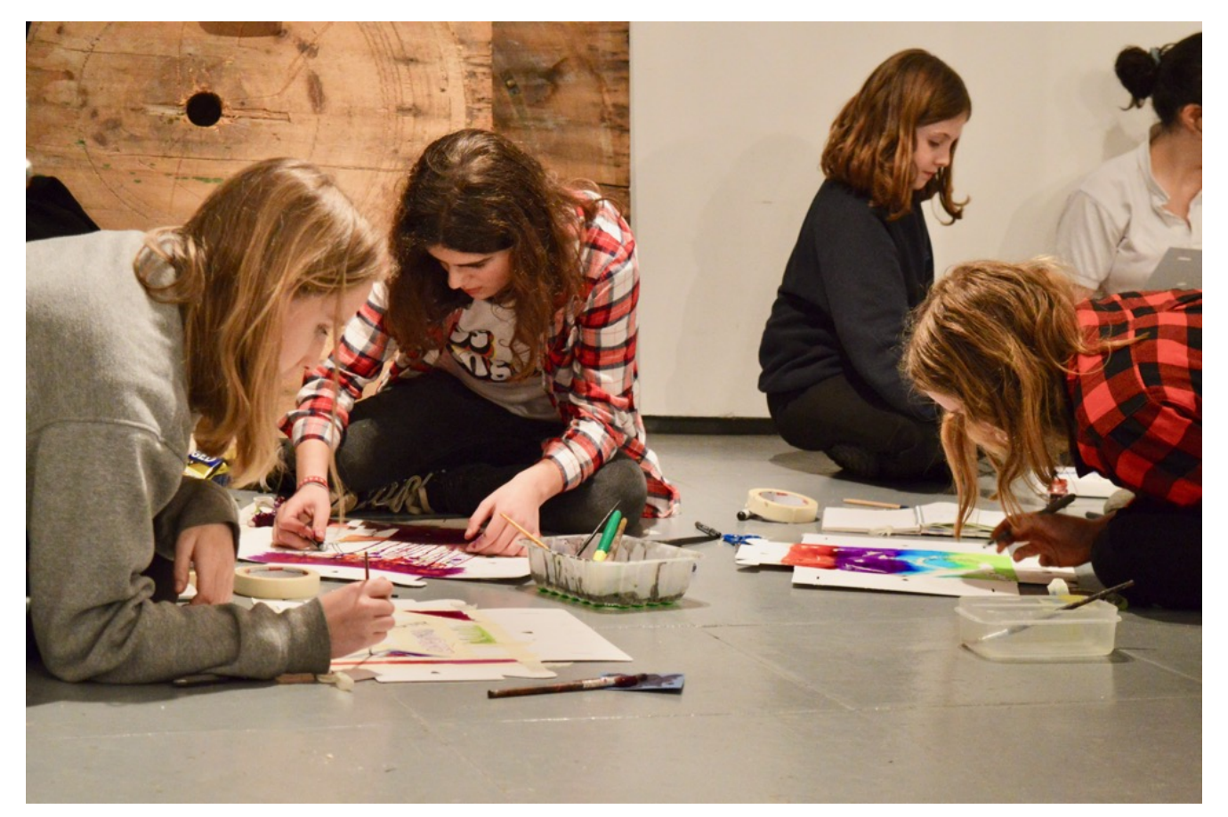
Schools, Colleges, Arts Organisations: Single and Multi-Users From £42

AccessArt is a UK Charity and we believe everyone has the right to be creative. AccessArt provides inspiration to help us all reach our creative potential.