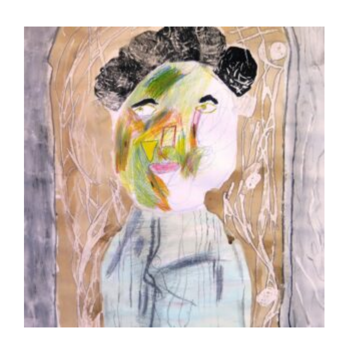
basic concepts in drawing and painting