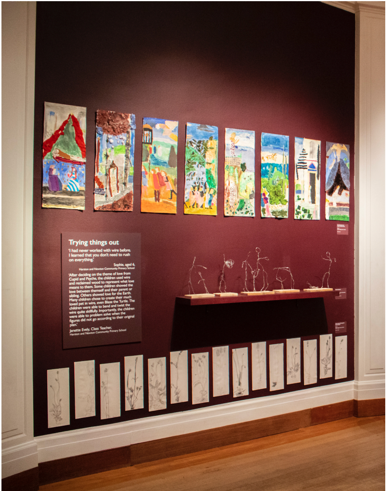
Cupid and Psyche by Year Five Pupils at Linton Heights Junior School, Cambridgeshire in 'Inspire', Fitzwilliam Museum, Cambridge

Linton Heights Junior School had a privileged opportunity to