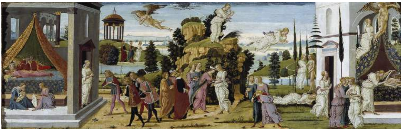
The Story of Cupid and Psyche Sellaio, Jacopo del; painter; Italian artist, 1441/2-1493