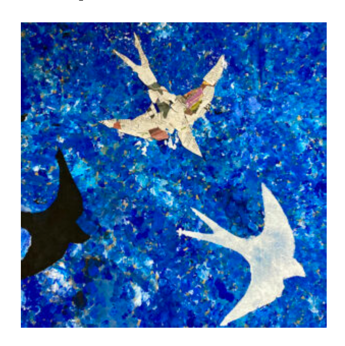
Birds in trees