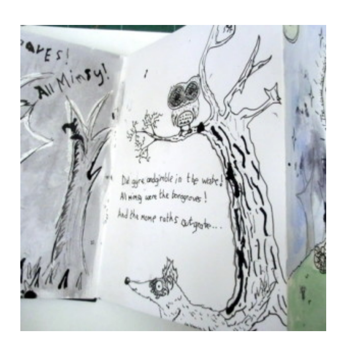
This is featured in the 'Storytelling Through Drawing' pathway