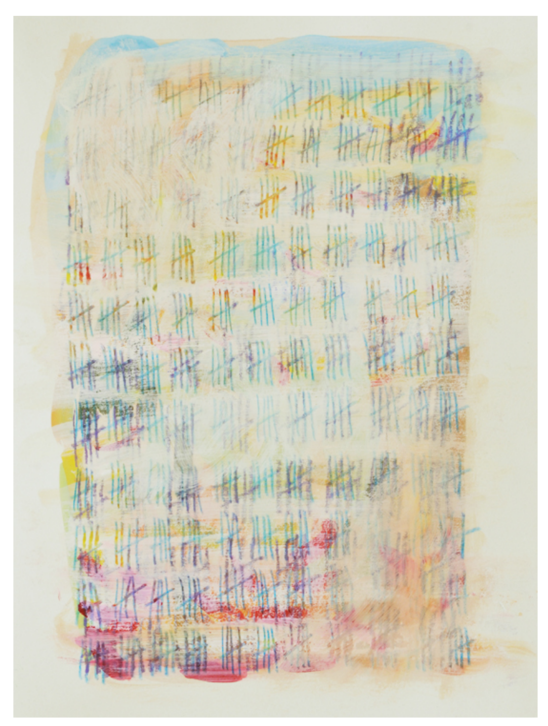
Autumn Tally by Sue Gough. Gouache, emulsion, coloured pencil on paper, 21.5 \times 29.5 \text{ cm}

The work is concerned with the cycle of life and the human condition. References to the landscape and the seasons provide the colours and textures, while the tally marks create the grids and structure.