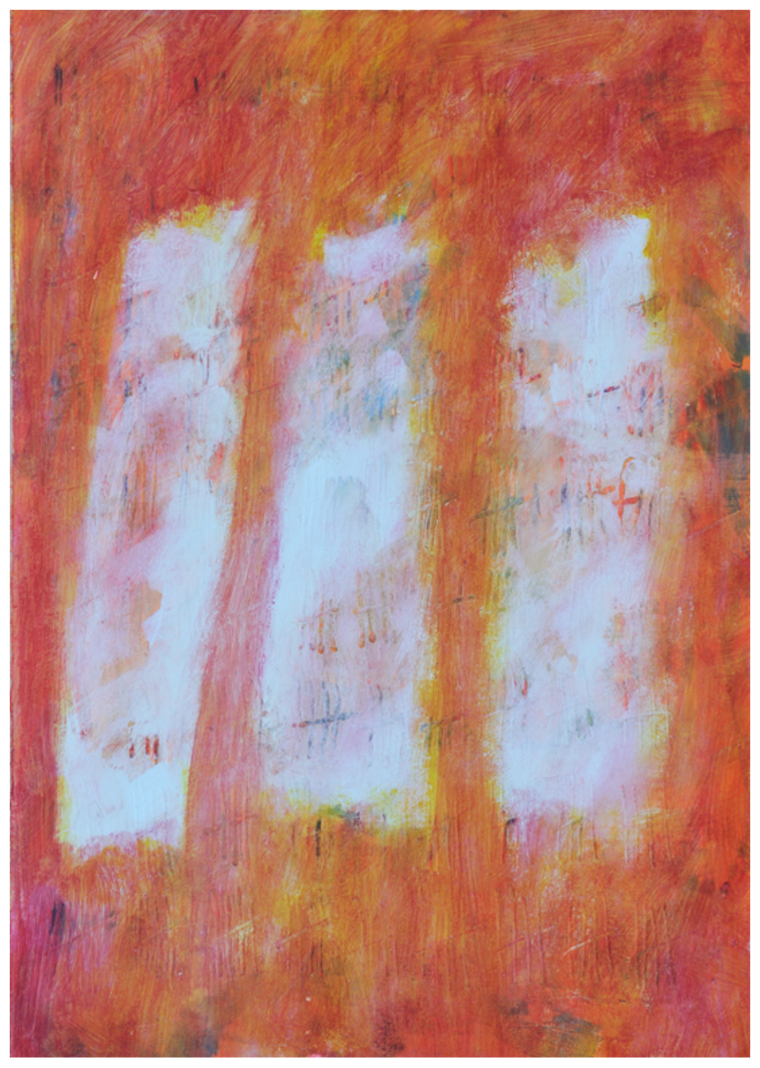
Autumn Study by Sue Gough. Gouache, emulsion, coloured pencil on paper, 21.5 \times 30.5 \text{ cm}

I am preparing to make a series of prints later this summer that will combine mono printing, collagraph and screen printing to produce some multi layered pieces and I am very much looking forward to spending some time exploring my ideas