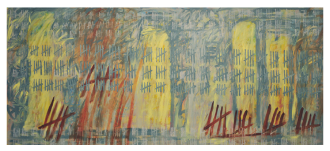
History Painting by Sue Gough. Acrylic on canvas, 405 x 174 cm \,

expressing my ideas within the theme, to keep my response flexible and fresh.