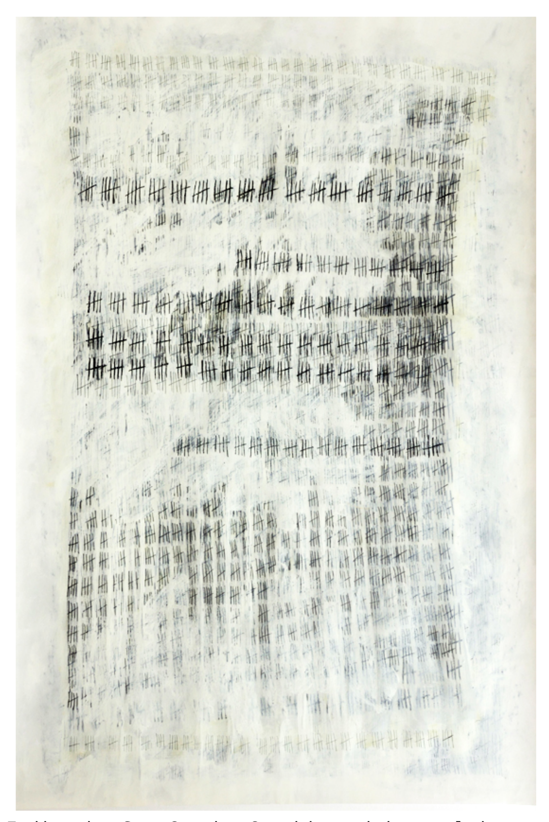
Fading by Sue Gough. Graphite, ink, emulsion on paper, 65 \times 98.5 \text{ cm}

Sue graduated in Fine Art with honours as a mature student in 1995. It was not until 2005, when she and her husband moved