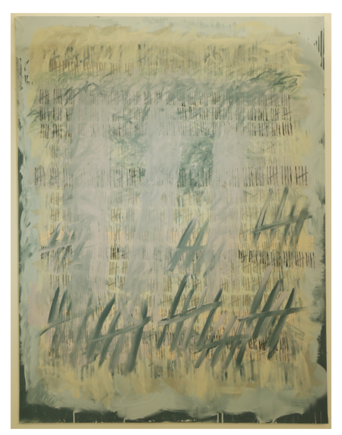
Many Endings (Winter) by Sue Gough. Acrylic on canvas, 172 \times 226.5 \text{ cm}

I intend to continue with this theme until I can no longer produce work that reflects it. I usually have drawings and paintings on the go at the same time; I move from one painting to another, while one dries or if it requires some thought about what needs doing to it for the next session; and from a painting to drawings. This enables me to develop new ways of