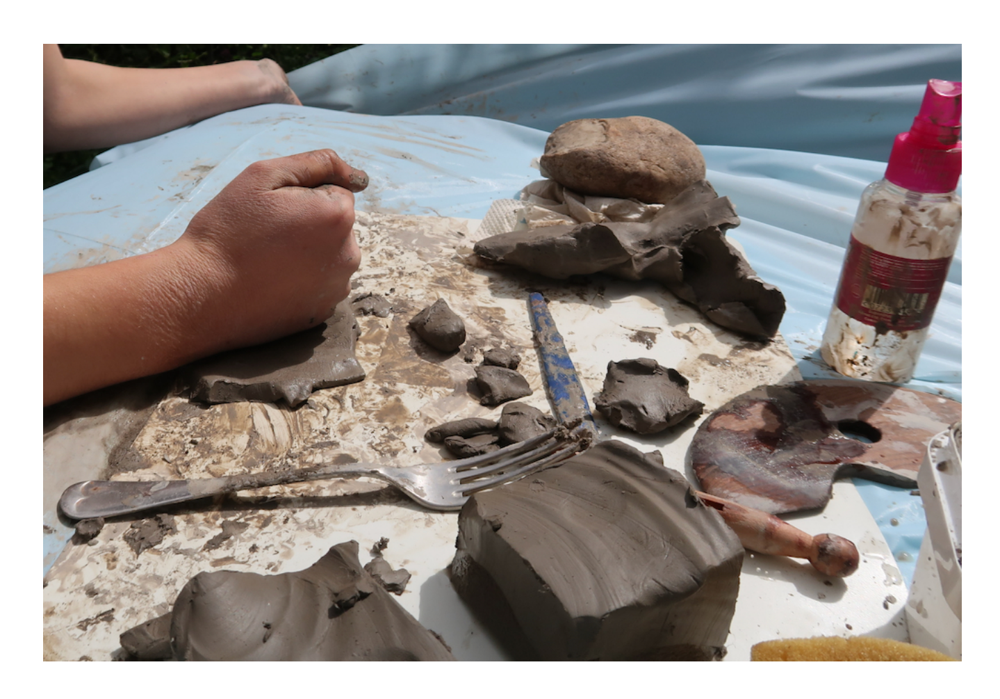
What Should I Make?

Anything! There really is no wrong or right way of working just trust your instincts and sense of play to explore shaping it!