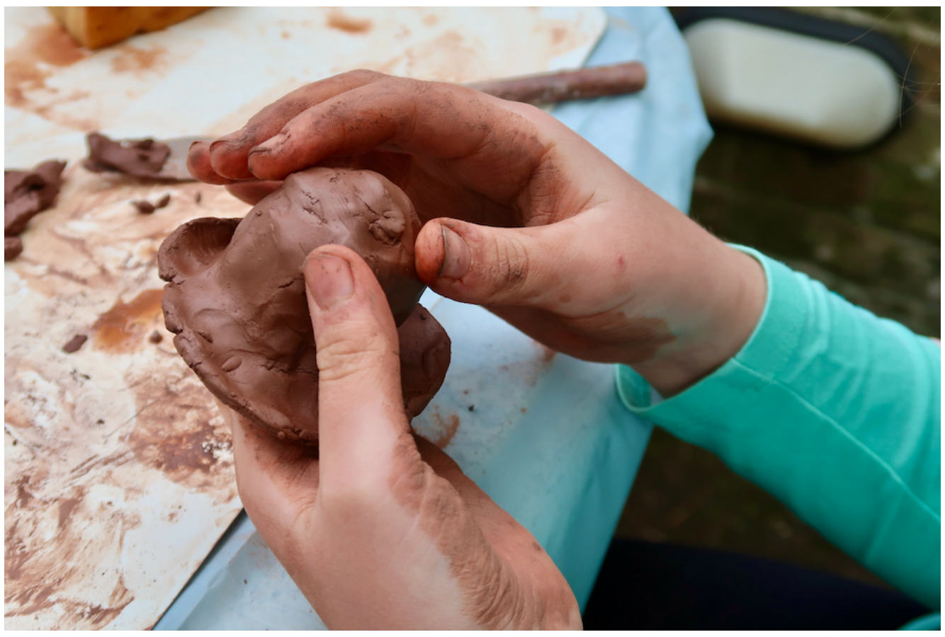
You Will Need: