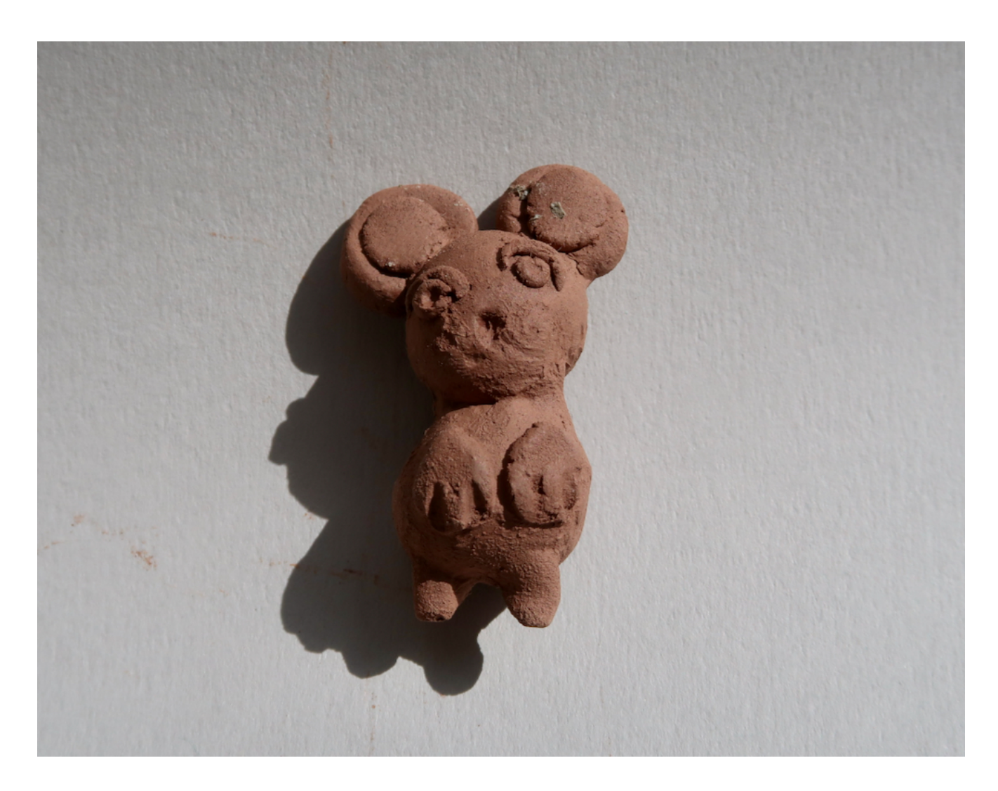
How Big Should I Work?

Unlike fired clay, air-drying clay does not have a huge amount of strength so it's best not to work too big. We would recommend that it's best suited for smaller, fist-sized models. Also, if you work too small, you might find it's a bit brittle and might crack, so best to work with a good thickness.