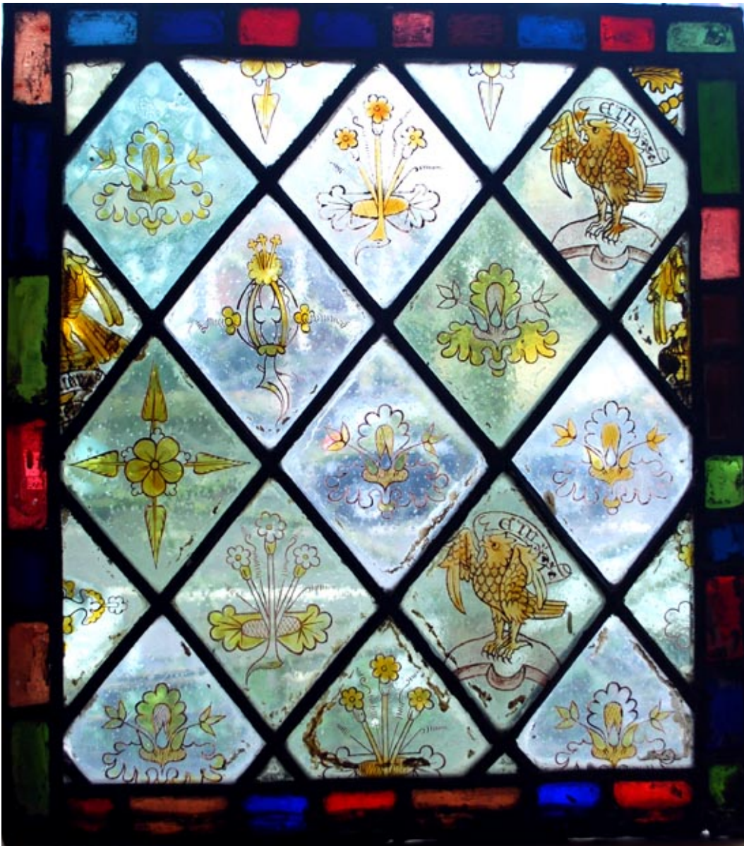
Window at the Leach Brother studio, City Road, Cambridge

The neo-gothic revival saw a resurgence in stained glass design for churches and domestic architecture of the day.