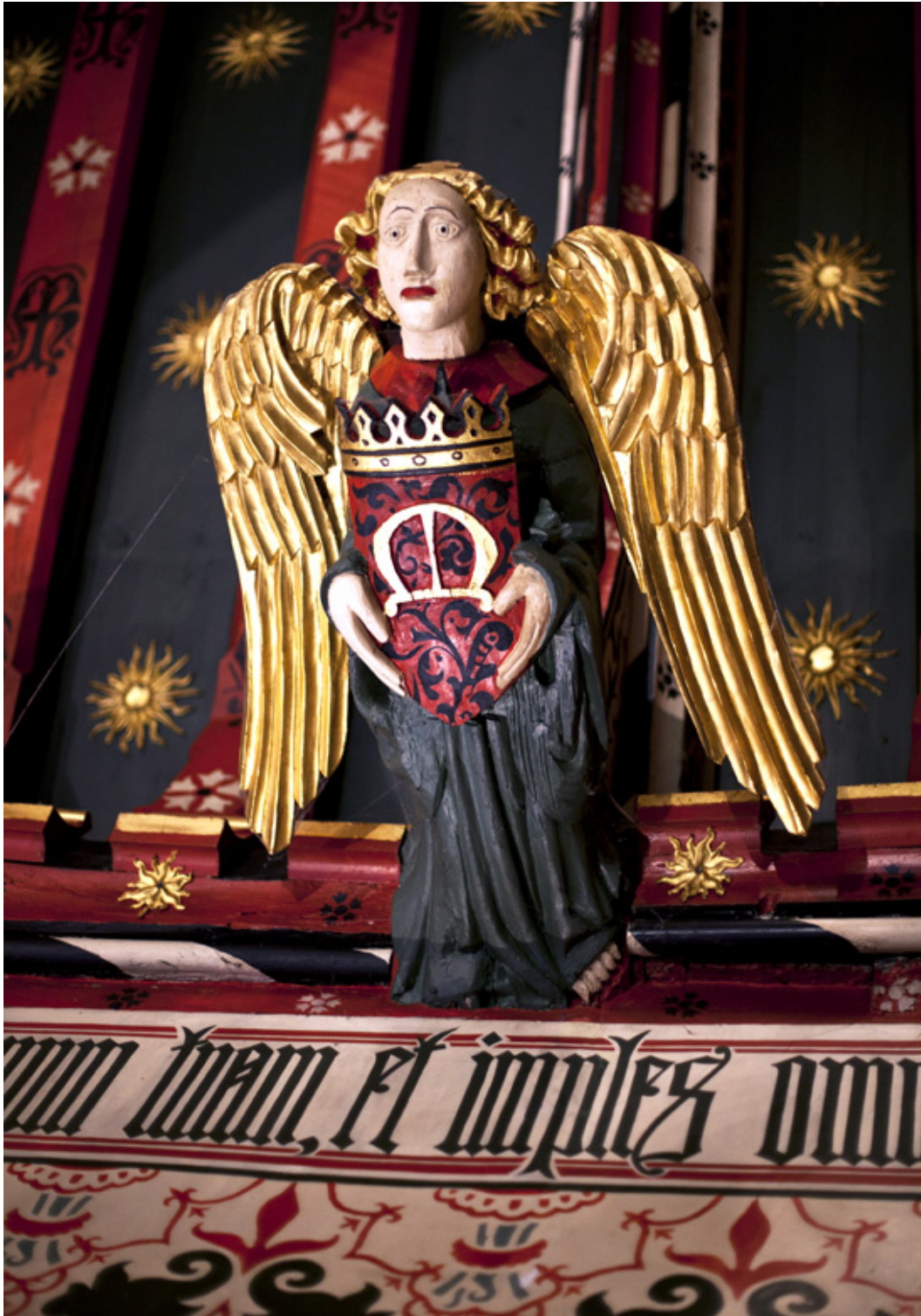
Gilding by the Leach Brothers in Queens College, Cambridge