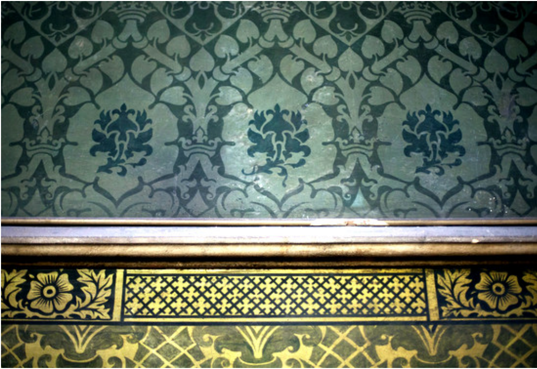
Example of hand painted decoration on plaster at All Saints Church, Cambridge

Wall painting was a popular decoration for churches during the neo-gothic revival in the mid to late Victorian era.