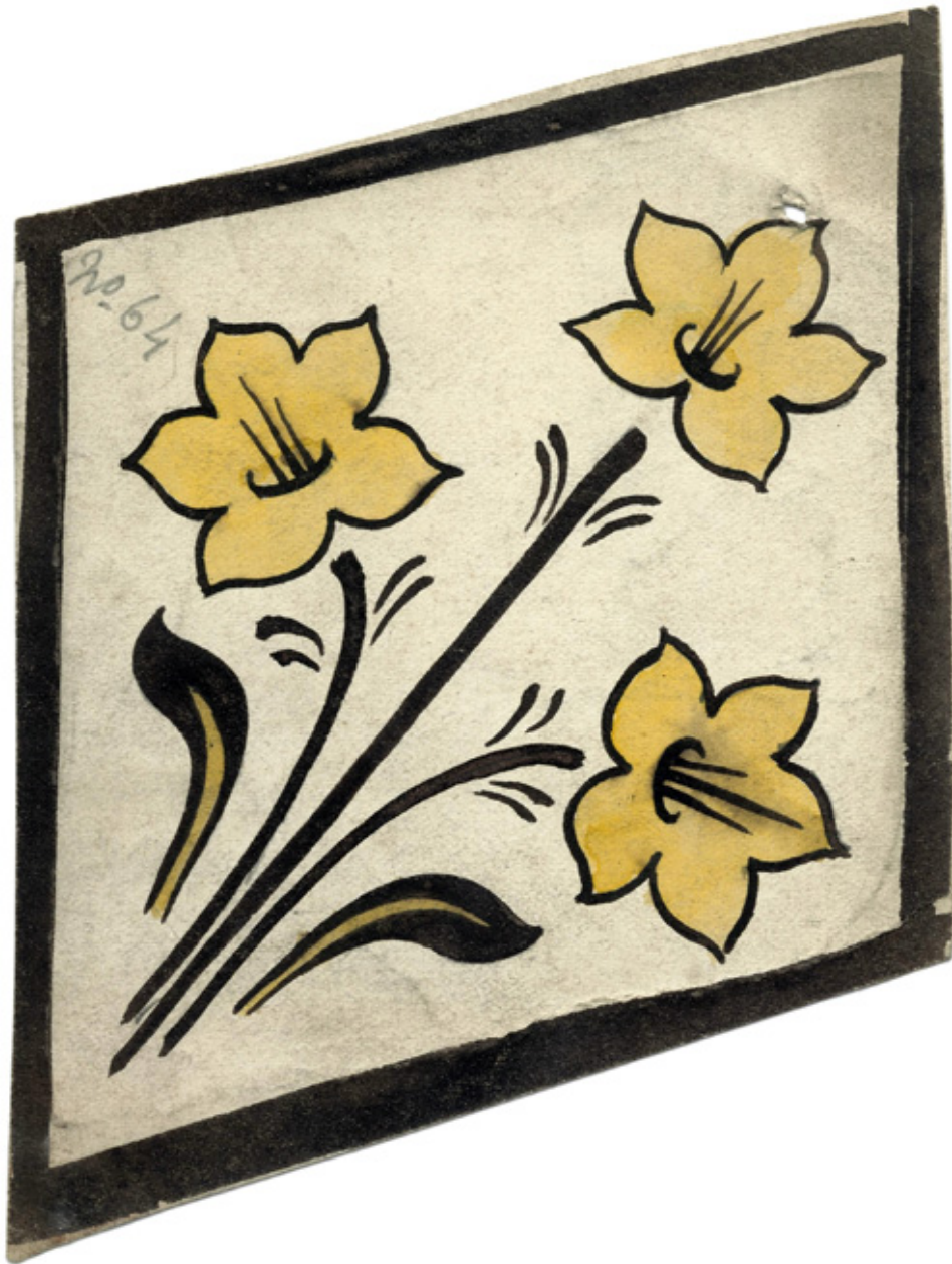
Leach Brother design for City Road of a 3 flower prong