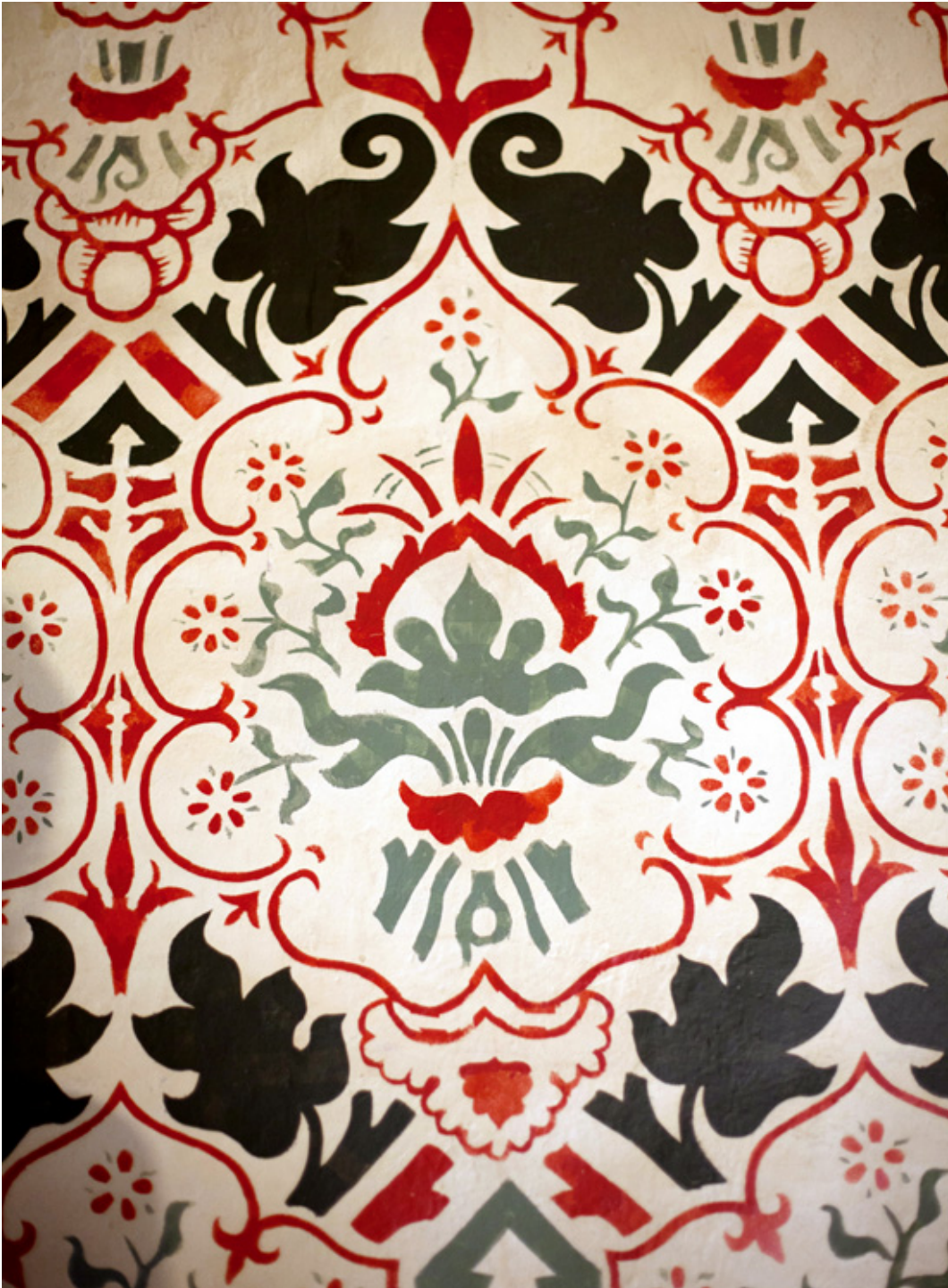
Wall decoration painted in Queens College, Cambridge

This technique is where the design is drawn out on paper and the outline is pricked all around to produce small holes.