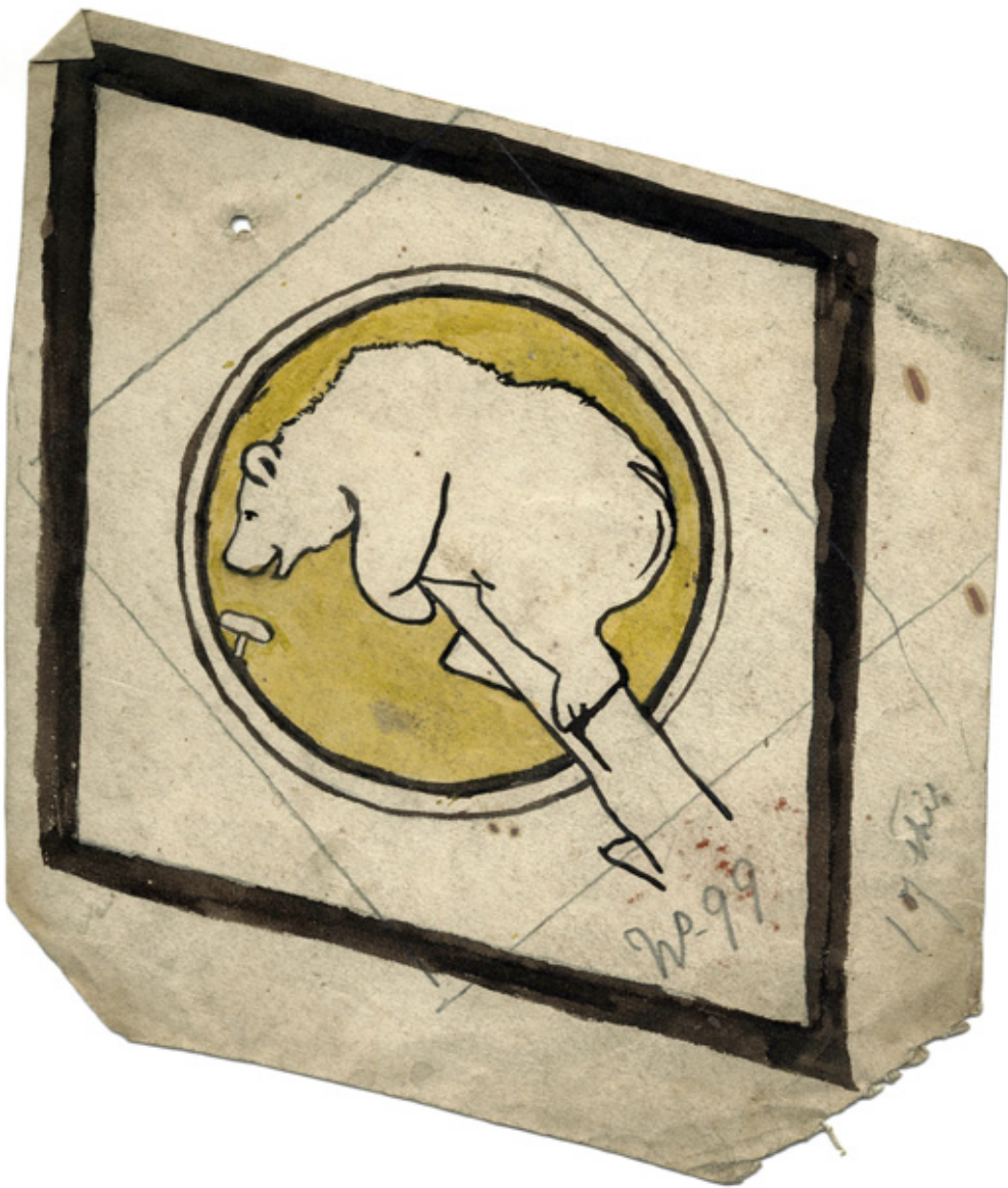
Leach Brother design for City Road of a bear