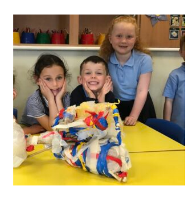
Dip your toes into implied Form through drawing

Build your understanding of how you can create the illusion of form through 2D drawings.