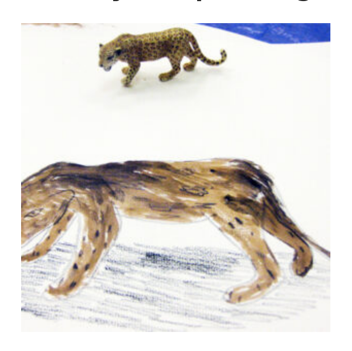
see three shapes