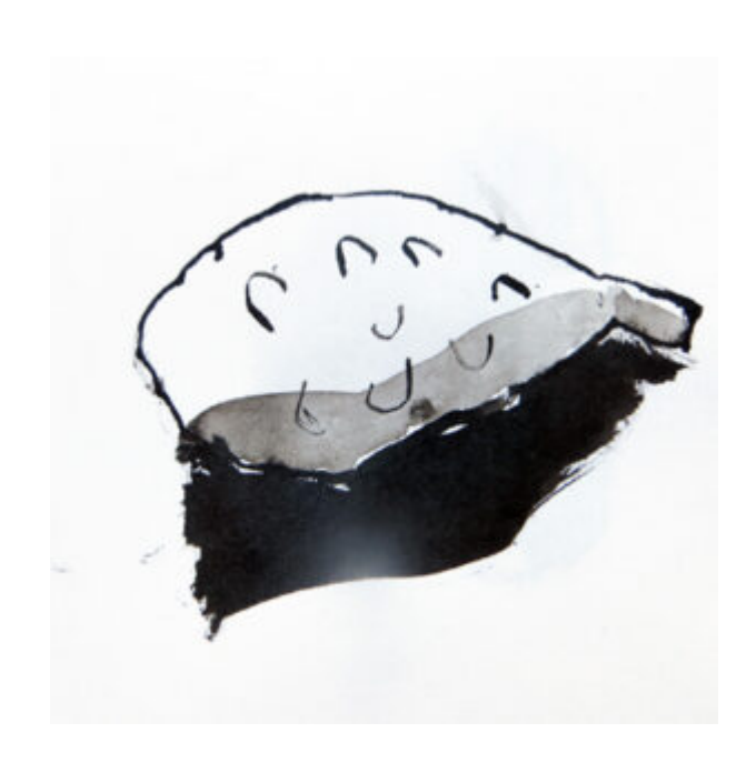
Flat yet sculptural