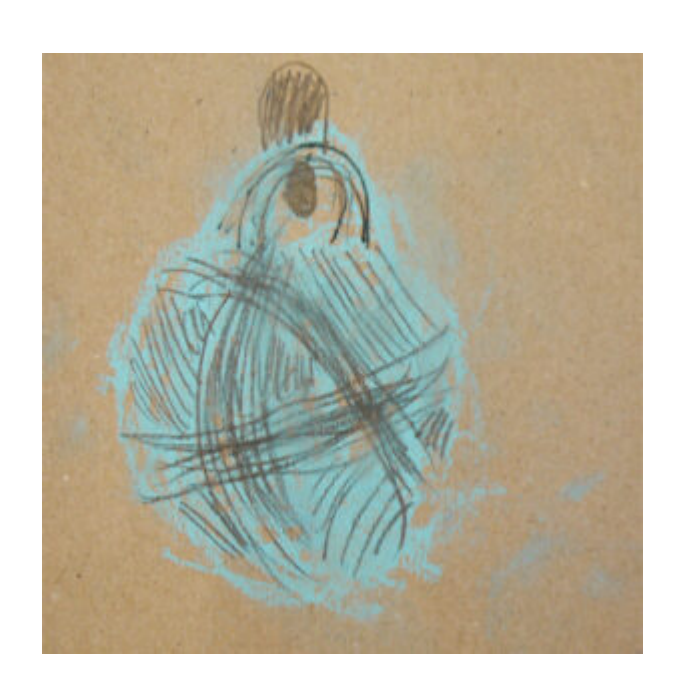
See All AccessArt Resources Exploring Form...