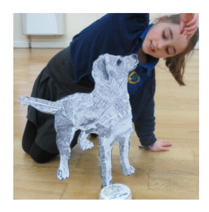
Letting Form and Colour Coexist