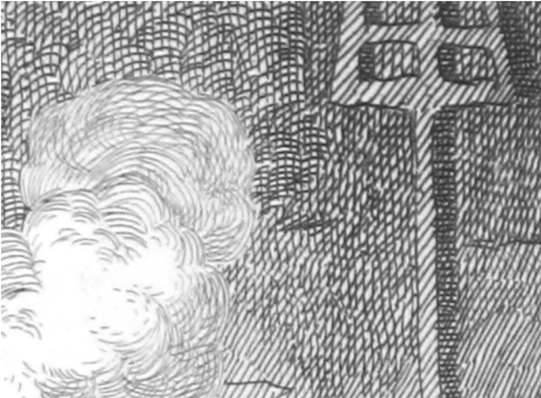
Detail of photocopied and enlarged engraving marks (taken from George Cruickshank's illustrations for Oliver by Charles Dickens)