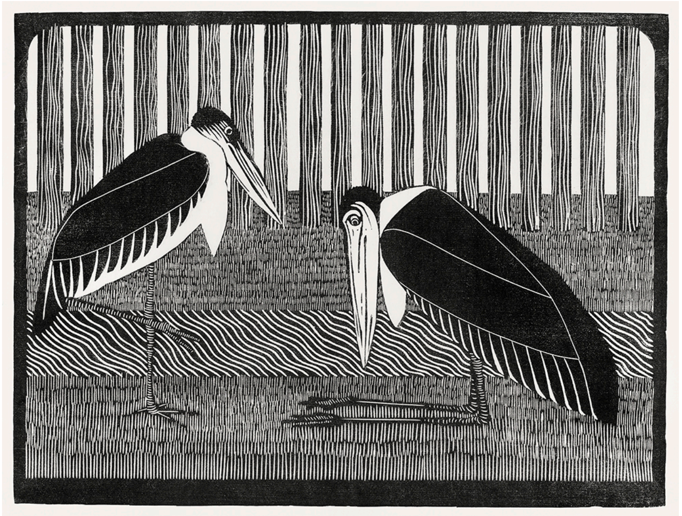
Two maraboos (Twee maraboos) (c.1914) by Samuel Jessurun de Mesquita. Original from The Rijksmuseum. Digitally enhanced by rawpixel. CC0

By the end of this activity, learners will have created a series of mark making cards which they can use in other projects.