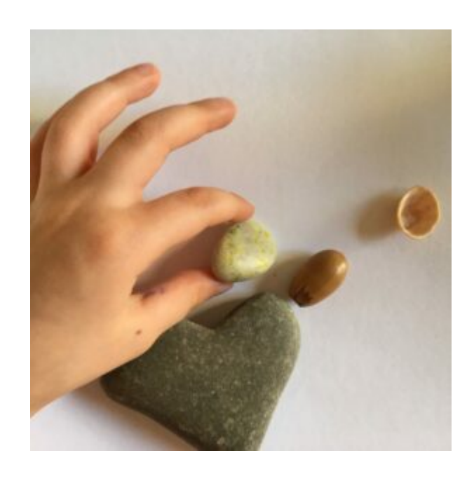
Adapt the "Shells: Observational and Imaginative