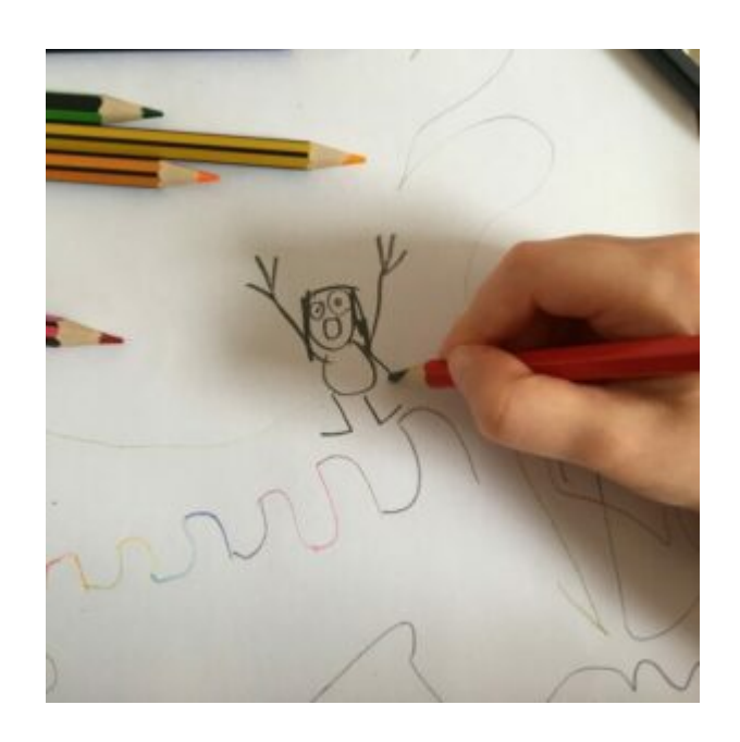
The EYFS and SEND Curriculum Collection Page

Open your mind and explore the many ways you can use poster paint in the class room. See the Video.