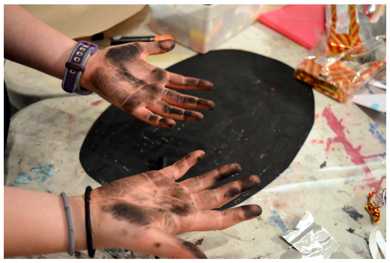
Creative practitioners, educators, teachers, parents, learners...