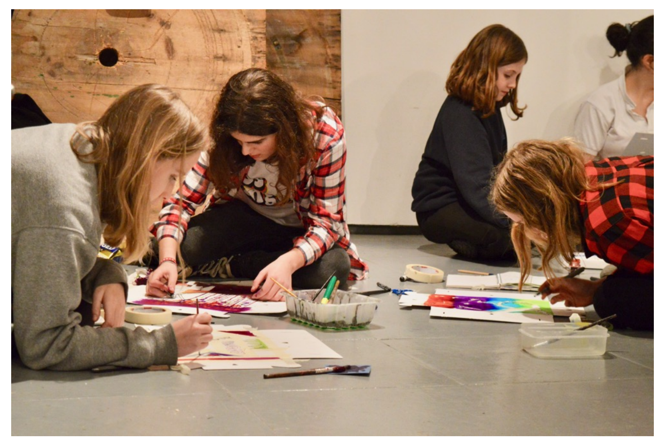
Schools, Colleges, Arts Organisations: Single and Multi-Users From £42

AccessArt is a UK Charity and we believe everyone has the right to be creative. AccessArt provides inspiration to help us all reach our creative potential.