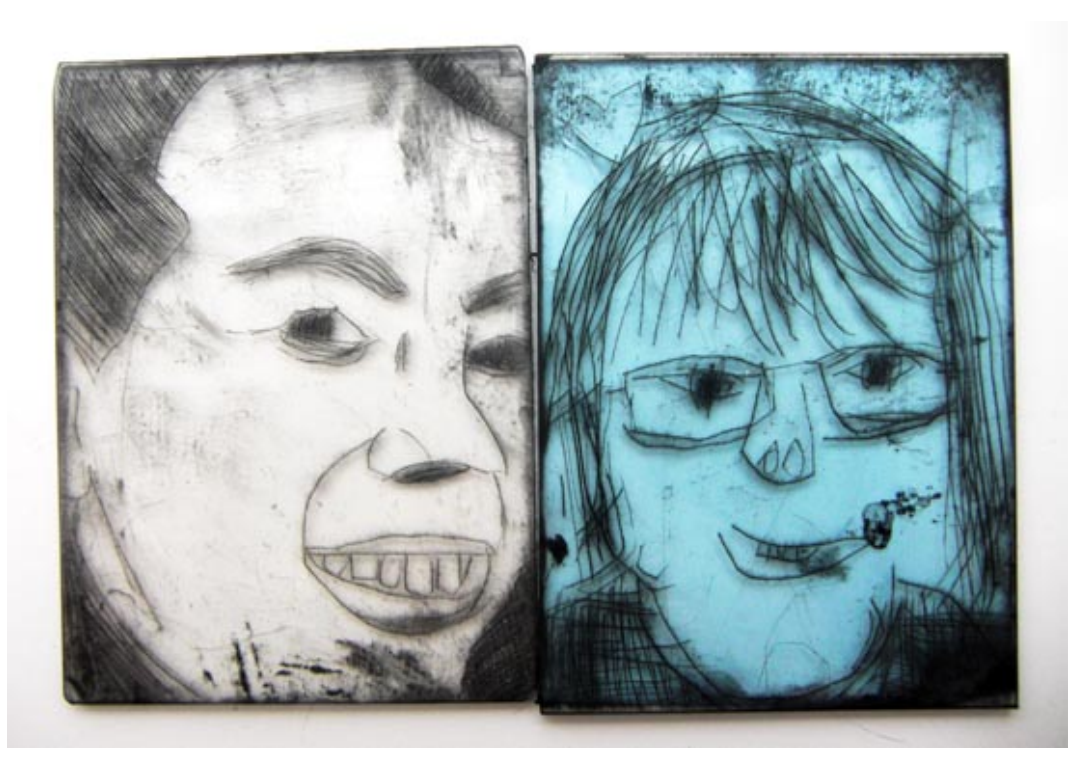
Inked-up perspex etchings

"I had been looking for a way to make simple but authentic etchings with my classes when a friend offered me the use of a table press. Other friends offered me exhibition space, and two of my schools dipped into a rainy day fund to buy beautiful paper, good water based printing ink and sheets of acrylic. It felt like the start of something great!