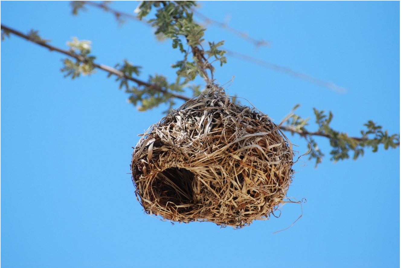
Bird nest hanging on a tree. Free public domain CC0 photo.