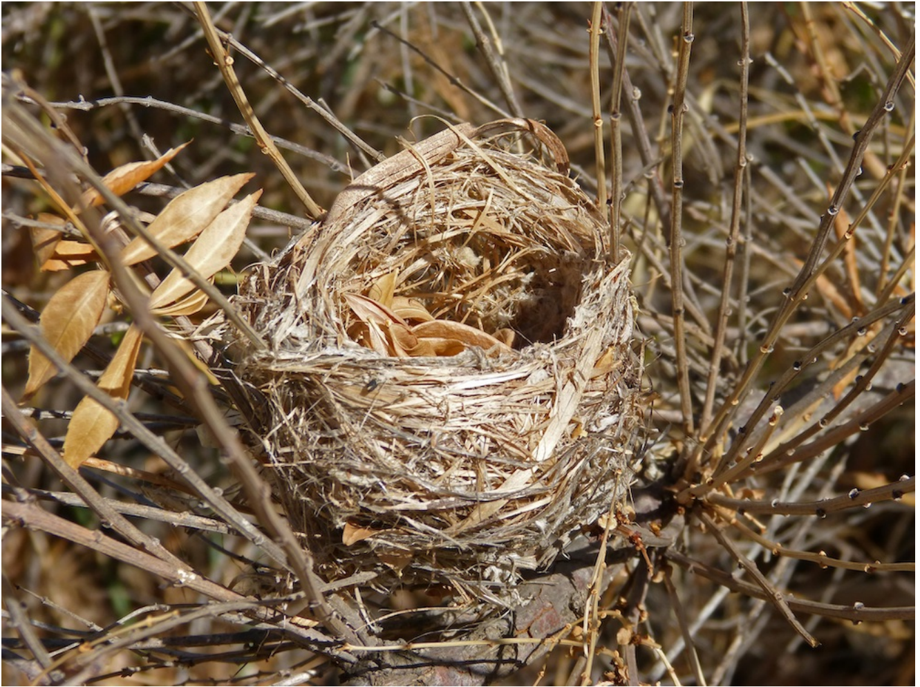
Birds nest in tree, nature photography. Free public domain CC0 image.