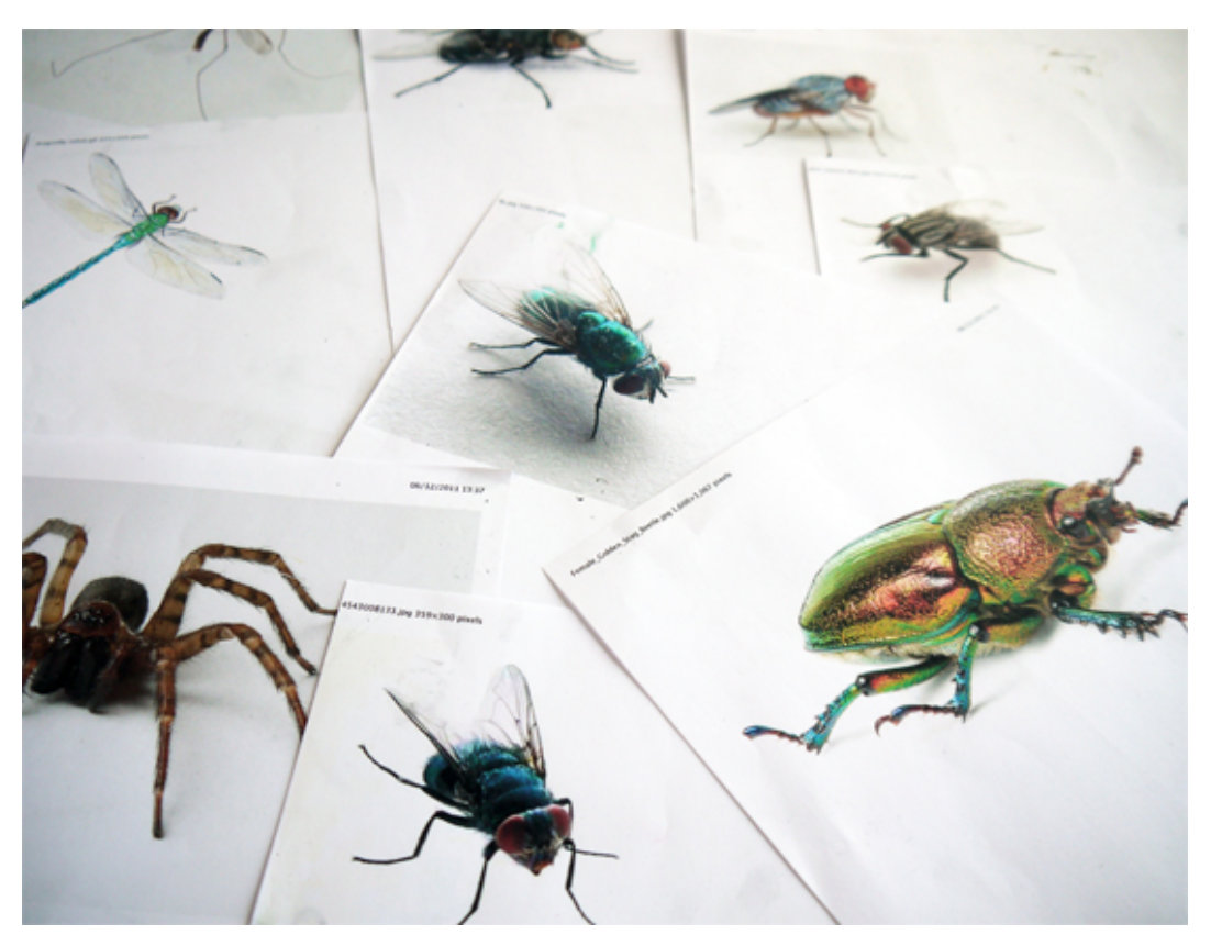
Drawing Minibeasts Workshop with Children aged 6 to 10

This resource describes how to use graphite and oil pastel to explore drawing minibeasts. Ideal lesson plan for introducing new drawing materials to primary aged children.