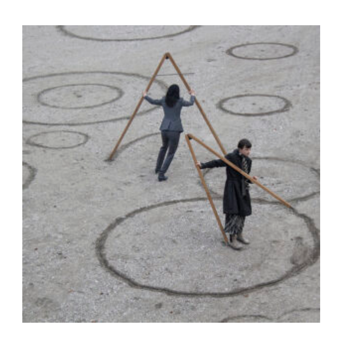
The ancient art of konan