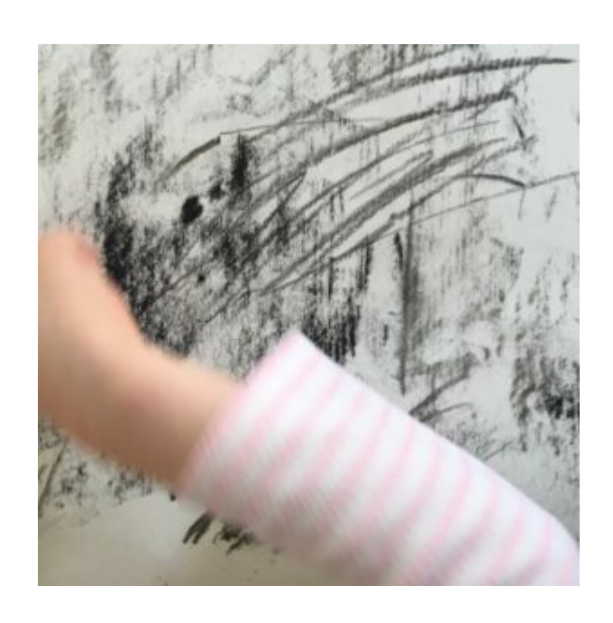
<u>Featured in the 'Gestural Drawing with</u> <u>Charcoal Pathway'</u>