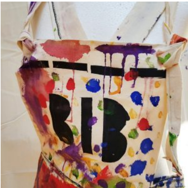
Pin and Paper Fashion