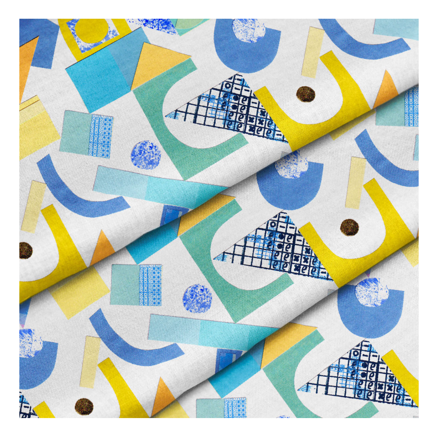
<u>A resource by Rachel Parker to help</u> <u>students build repeat patterns</u>