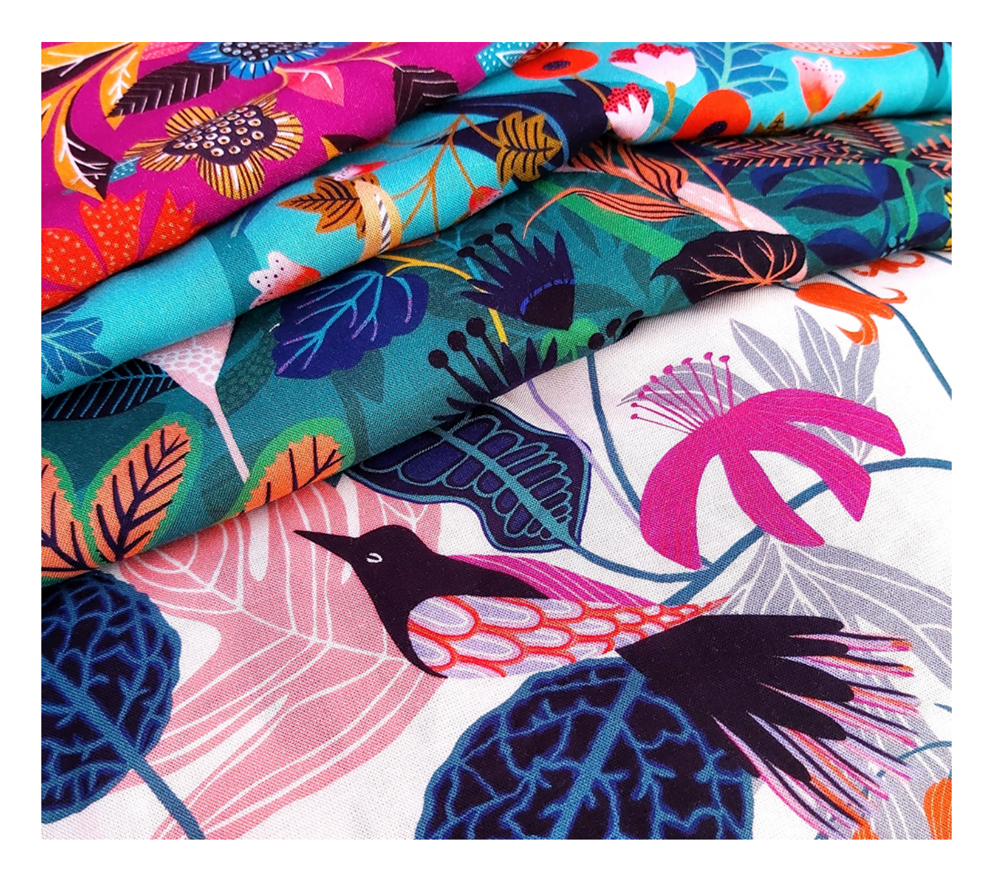
Find out about Rachel's journey to becoming a pattern designer