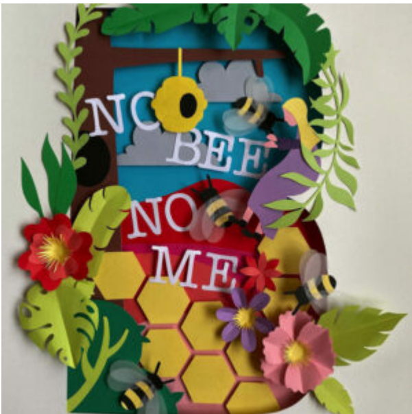
Njideka Akunyili Crosby