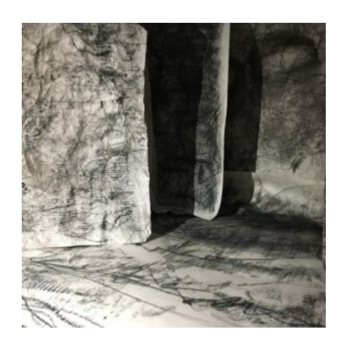
This is featured in the 'Gestural Drawing with Charcoal' pathway