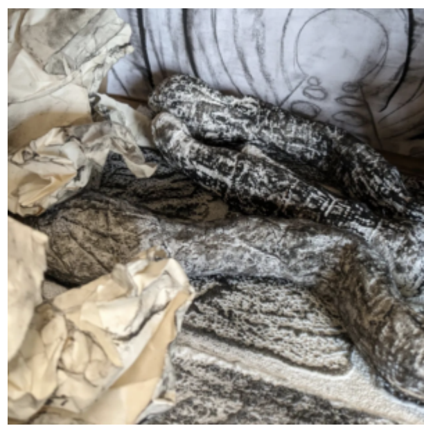
You May Also Like...