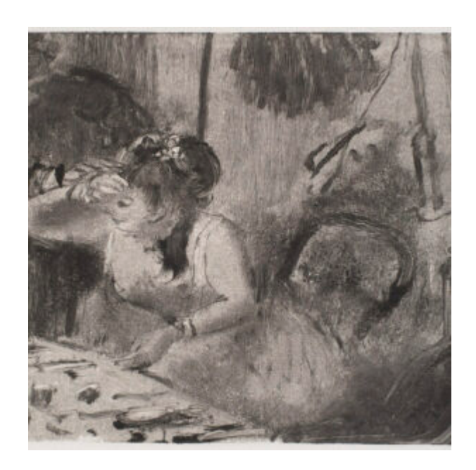
Talking Points: What is Chiaroscuro?