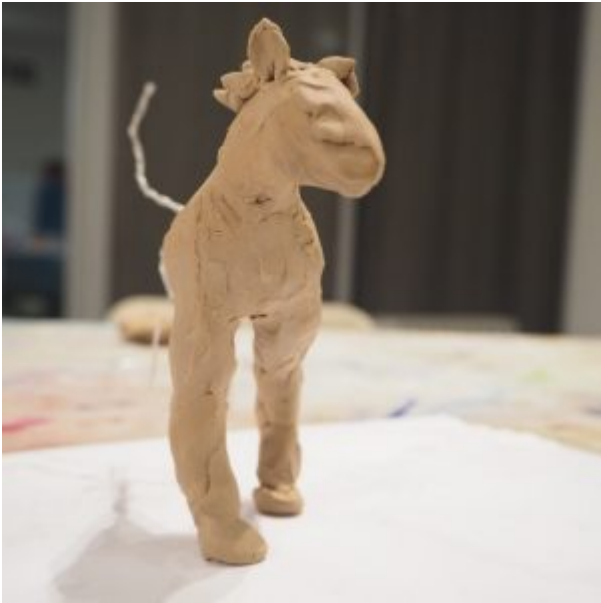
Casting In Negative Space