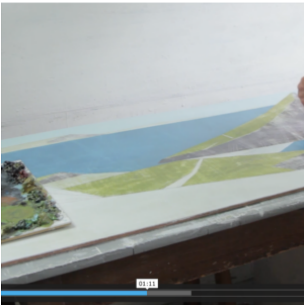
Talking Points: The Shoreditch Sketcher