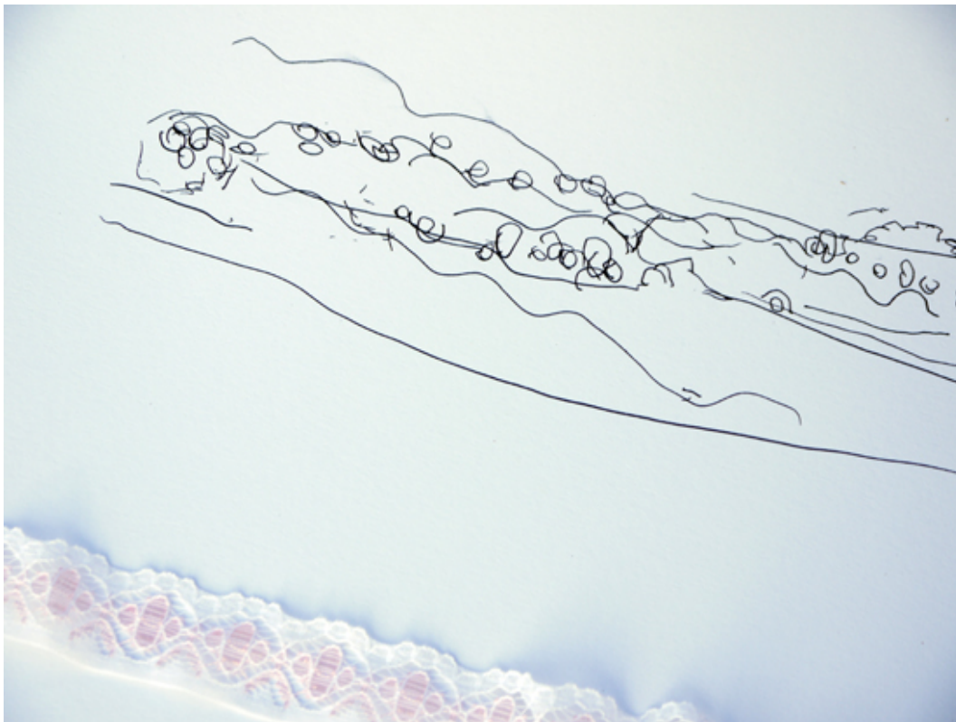
A typical "blind contour drawing"

In this resource we describe the process and suggest some suitable subject matter and drawing materials.