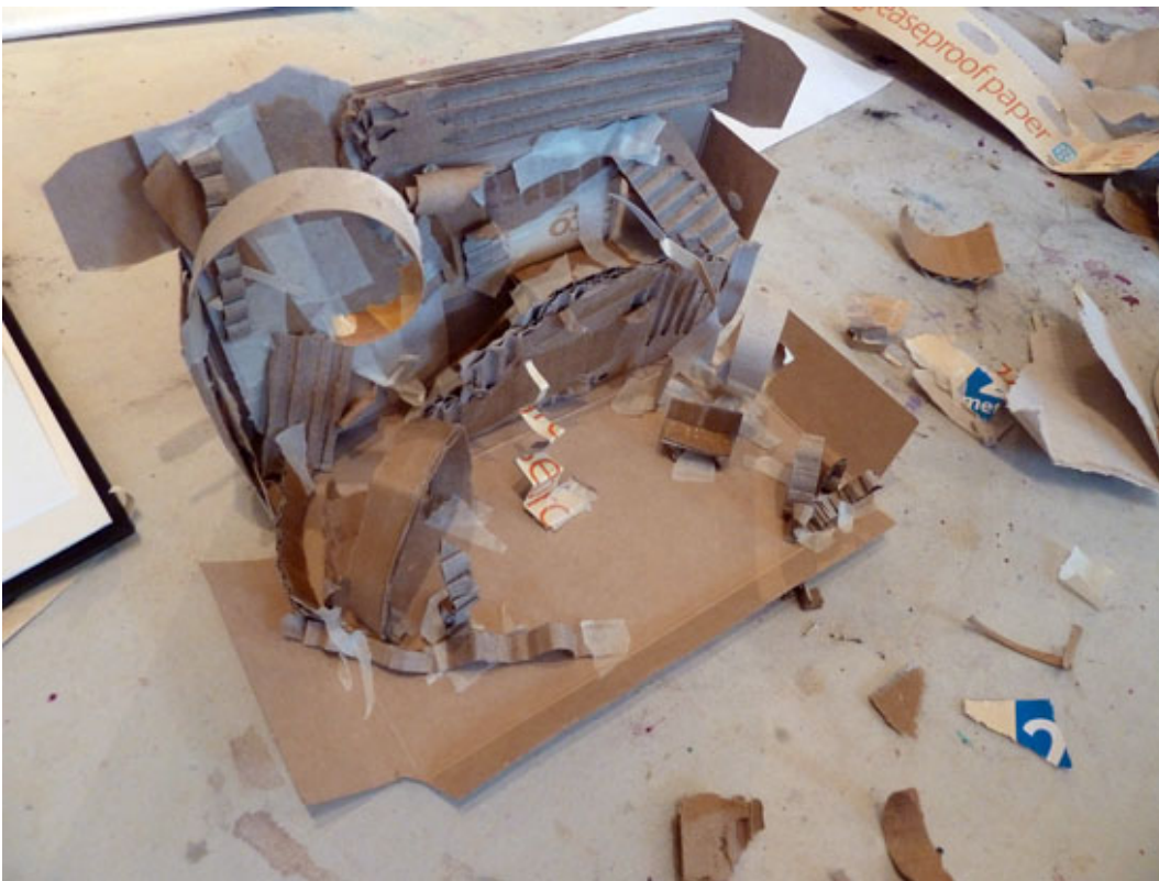
Eloise's 'scratch model'

This workshop is an extension of Responding to Text - Experimental Drawing , but this time uses text extracts as a starting point to make 'scratch models' or initial three dimensional model sketches for set designs.