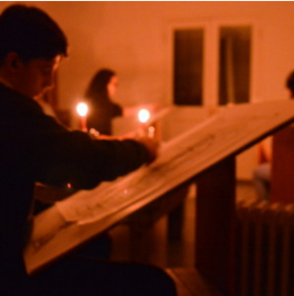
Candlelit Still Life