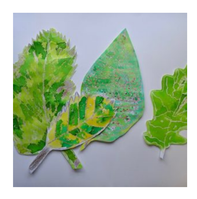
<u>Visual Arts PLanning: Tees, Forest and Landscapes</u>