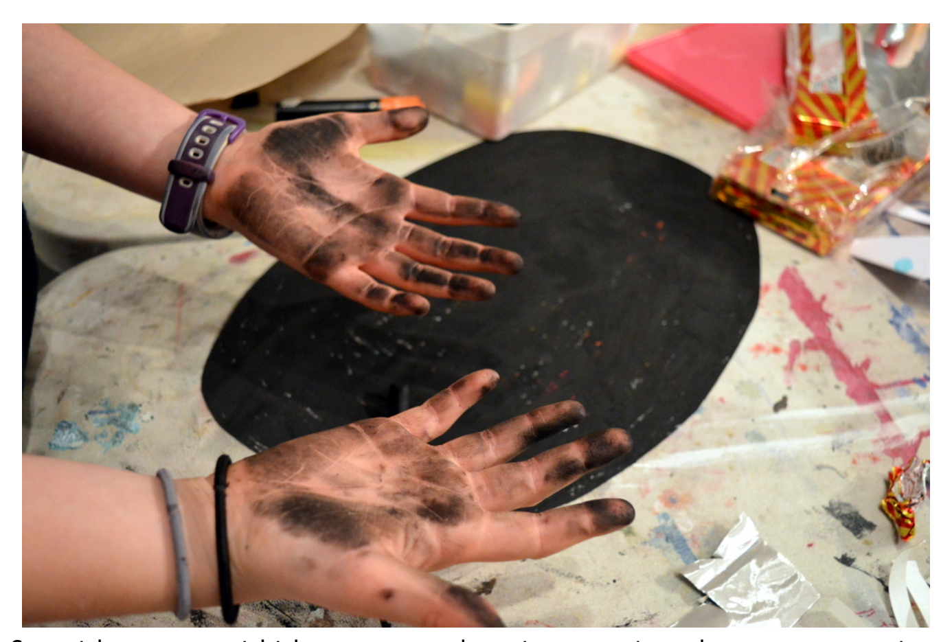
Creative practitioners, educators, teachers, parents, learners…