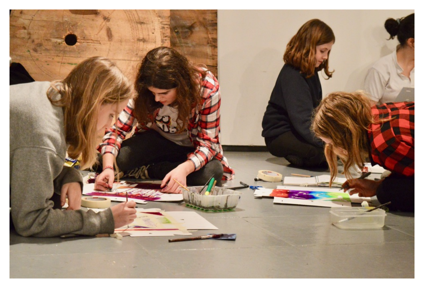
Schools, Colleges, Arts Organisations: Single and Multi-Users From £42

AccessArt is a UK Charity and we believe everyone has the right to be creative. AccessArt provides inspiration to help us all reach our creative potential.