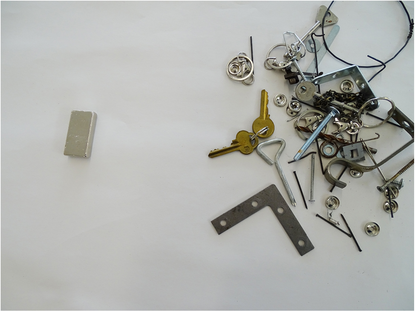
Magnet and metallic forms

This week I took in a super strong magnet and a collection of iron forms. We took it in turns to create our own mini-sculptures working with the magnetic forces.