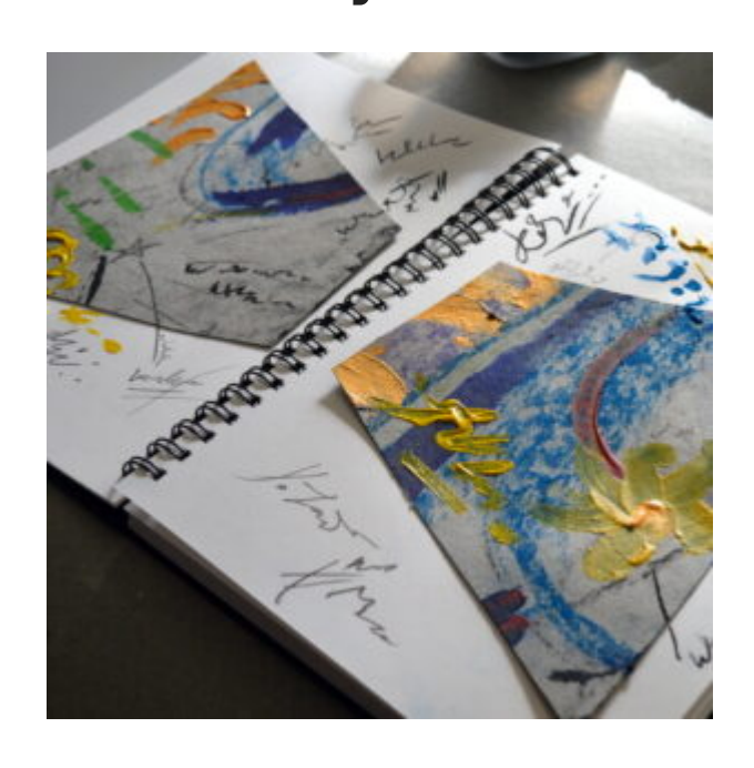
See All AccessArt Resources Arts and Wellbeing...