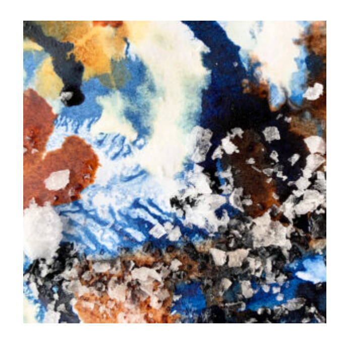
mark making and sound