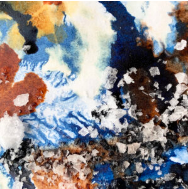
mark making and sound