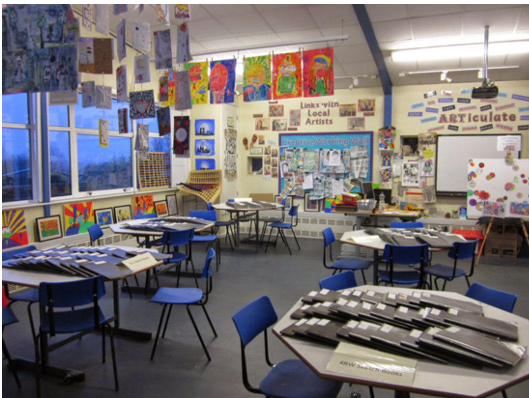
Gomersal Art Room