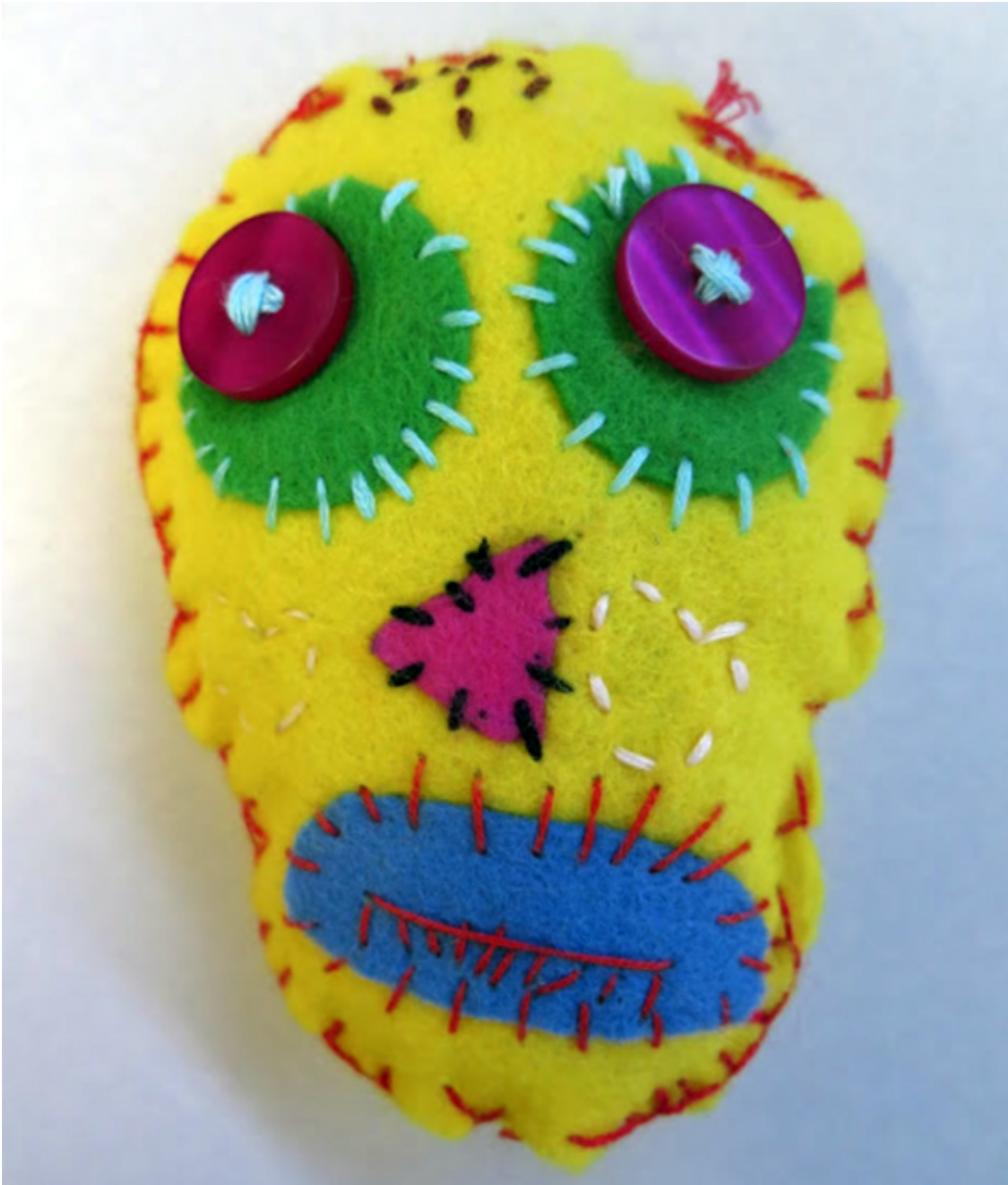
Day of the Dead Sewing Project